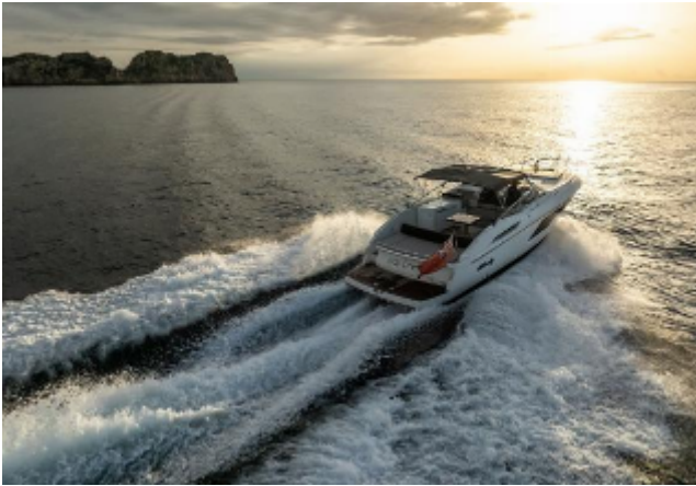
Windy 39 Camira For Sale