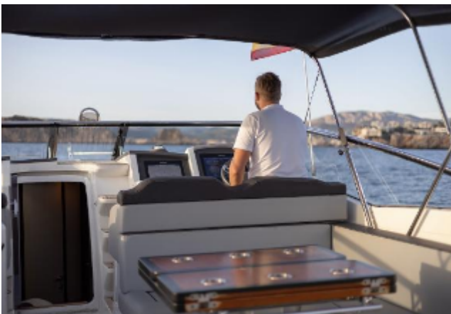
Windy 39 Camira For Sale