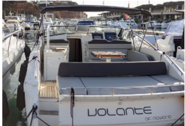
Windy 39 Camira For Sale