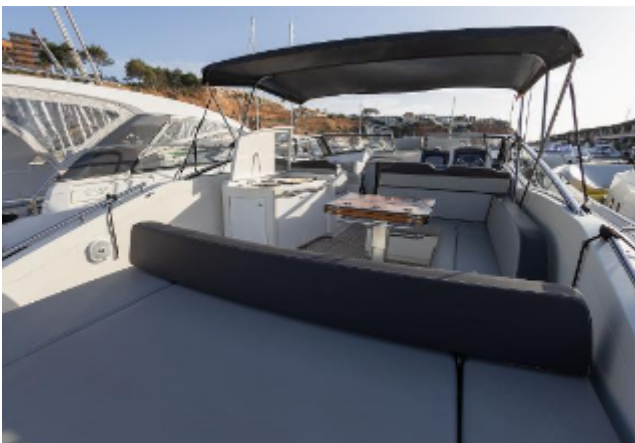
Windy 39 Camira For Sale