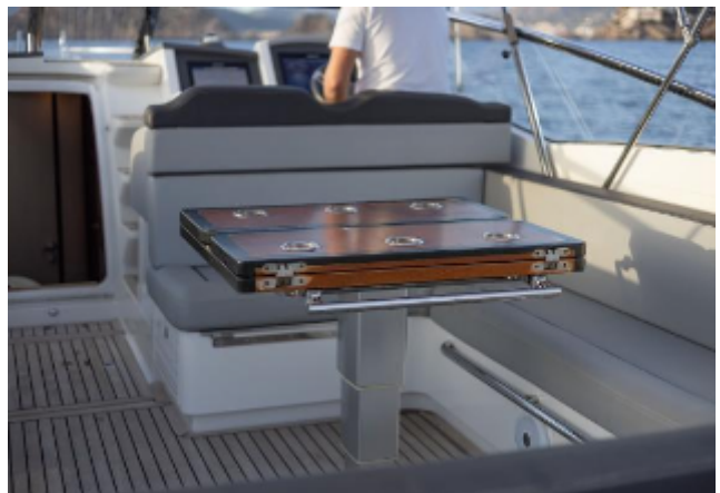
Windy 39 Camira For Sale