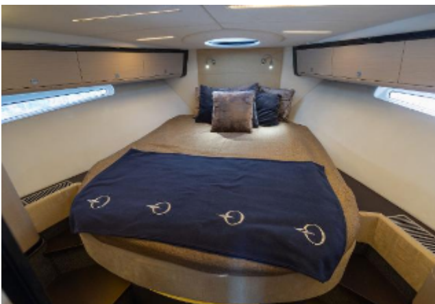
Windy 39 Camira For Sale