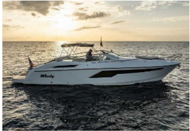
Windy 39 Camira For Sale