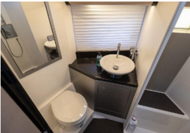
Windy 39 Camira For Sale