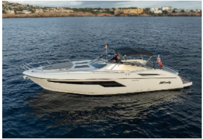
Windy 39 Camira For Sale