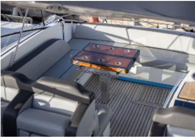
Windy 39 Camira For Sale