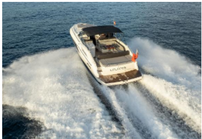
Windy 39 Camira For Sale