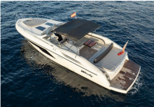
Windy 39 Camira For Sale