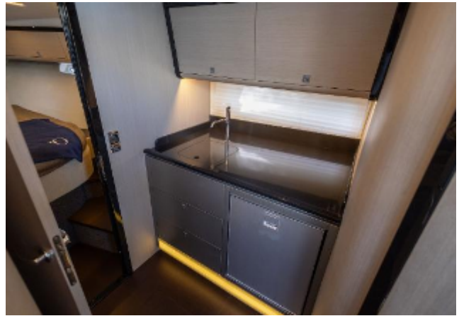
Windy 39 Camira For Sale