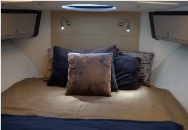
Windy 39 Camira For Sale