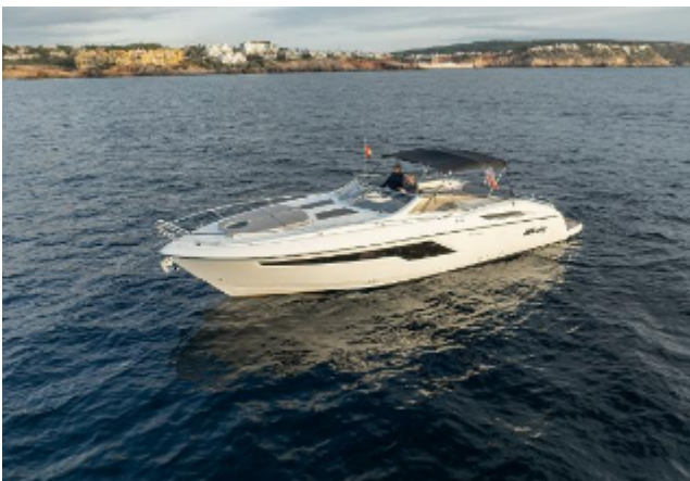
Windy 39 Camira For Sale