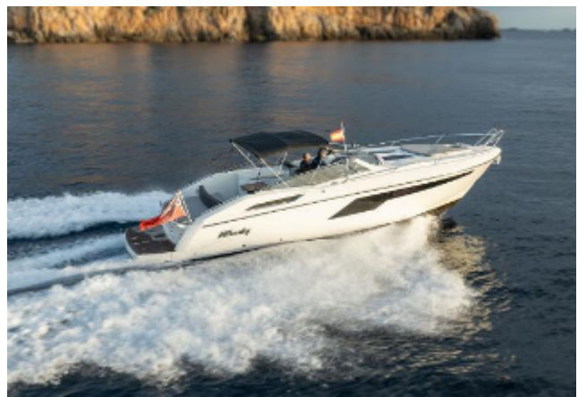
Windy 39 Camira For Sale