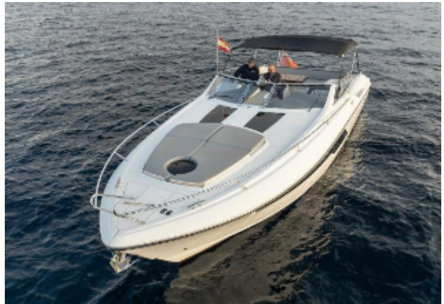
Windy 39 Camira For Sale