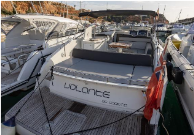
Windy 39 Camira For Sale