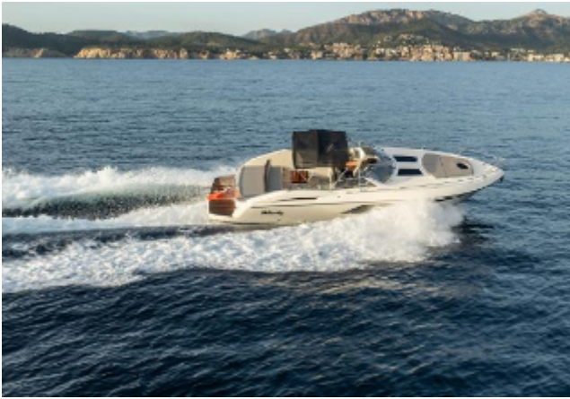
Windy 39 Camira For Sale