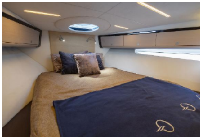
Windy 39 Camira For Sale