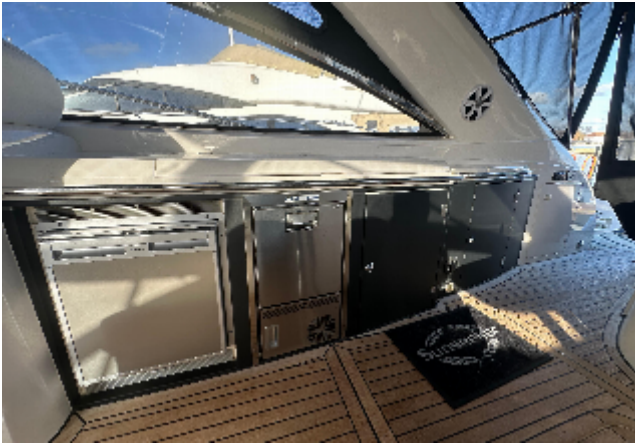
Sunseeker Camargue 50 yacht interior, featuring sleek cabinetry and modern appliances, 2001 model.