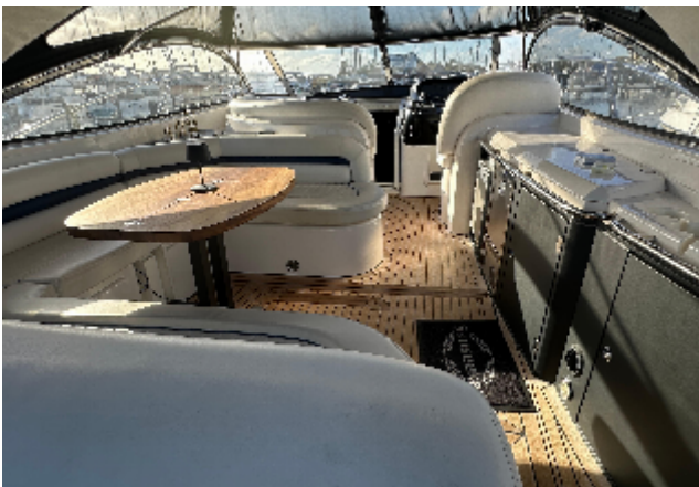
Interior of 2001 Sunseeker Camargue 50 yacht with elegant seating and wooden table.