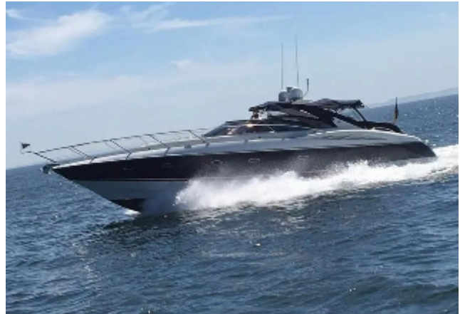
2001 Sunseeker Camargue 50 yacht cruising on open water.