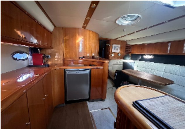
Luxurious interior of 2001 Sunseeker Camargue 50 yacht with wood finishes and seating area.