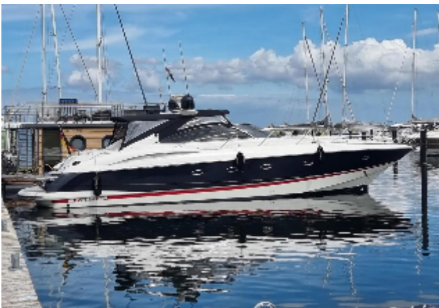
2001 Sunseeker Camargue 50 yacht docked in a marina under a blue sky.