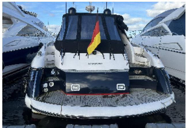
2001 Sunseeker Camargue 50 yacht docked, displaying a German flag, rear view.