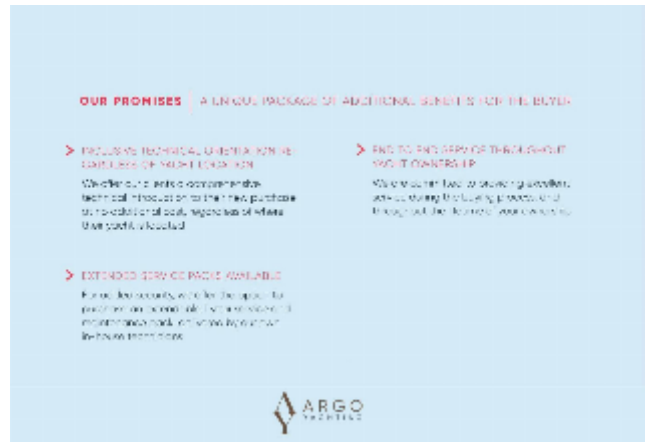
Argo Yachting offers comprehensive service benefits for Sunseeker Camargue 50 buyers, including technical orientation.