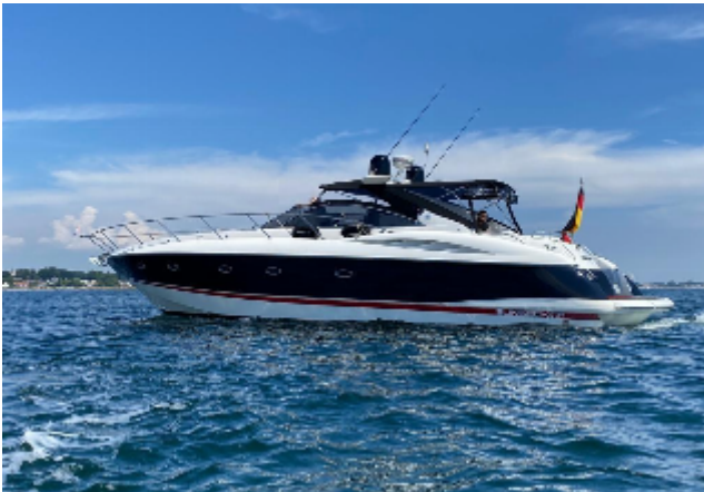
2001 Sunseeker Camargue 50 yacht cruising on open water under a clear blue sky.