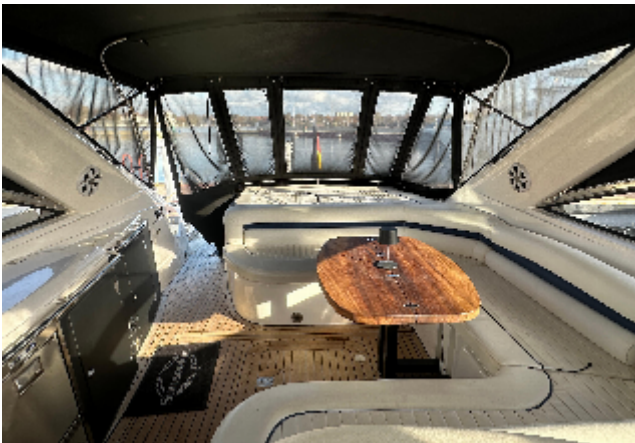
Luxurious interior of 2001 Sunseeker Camargue 50 yacht with elegant seating and wooden table.