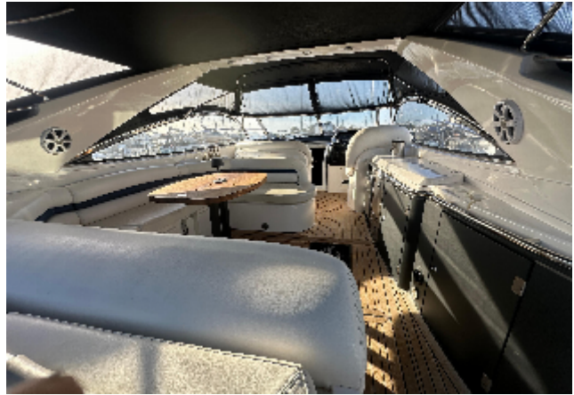
Interior of 2001 Sunseeker Camargue 50 yacht with elegant seating and wooden flooring.