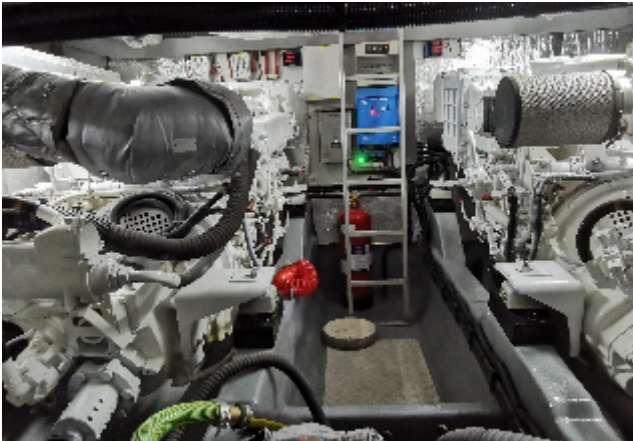
Engine room of a 2001 Sunseeker Camargue 50 yacht, featuring dual engines and control systems.