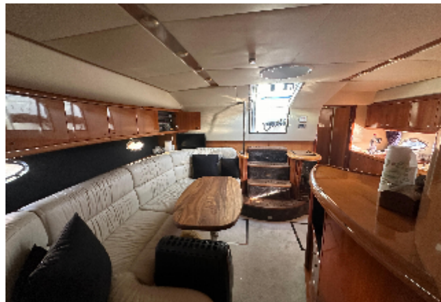
Luxurious interior of 2001 Sunseeker Camargue 50 yacht with elegant wood finishes.