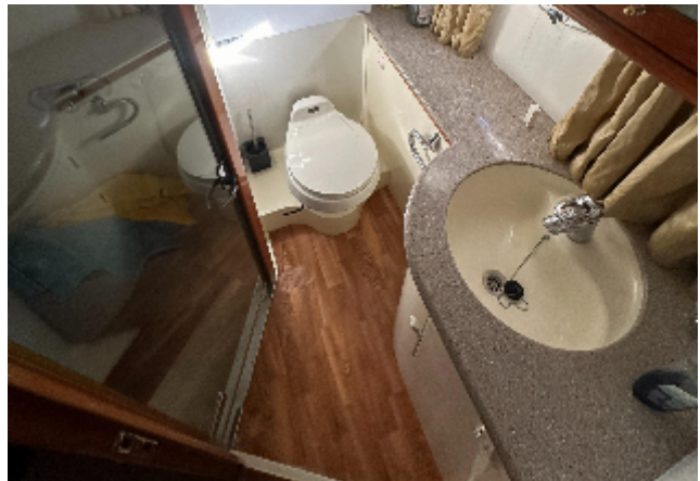
Bathroom interior of 2001 Sunseeker Camargue 50 yacht, featuring sink and toilet.