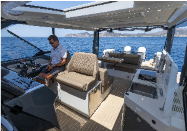
2024 Saxdor 400 GTO interior with seating, helm, and ocean view.