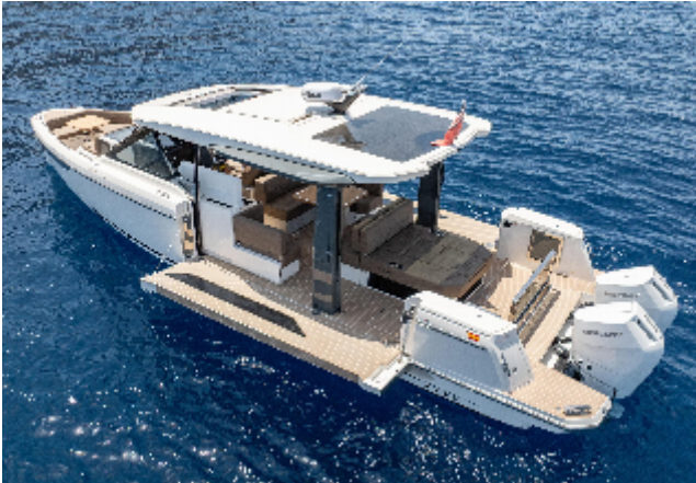
2024 Saxdor 400 GTO luxury boat on blue ocean water, featuring spacious deck and twin Mercury engines.