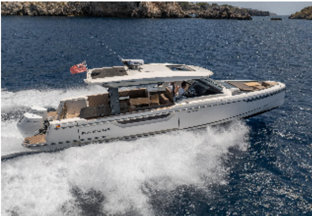
2024 Saxdor 400 GTO cruising on open water, showcasing sleek design and powerful performance.