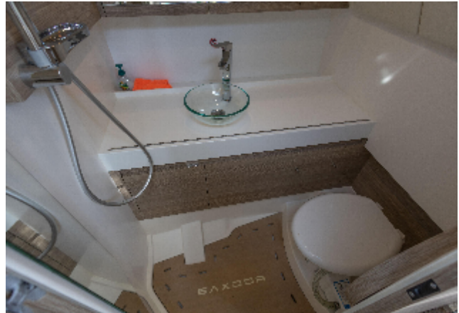
2024 Saxdor 400 GTO bathroom with modern fixtures and compact design.