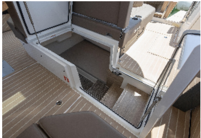
2024 Saxdor 400 GTO interior with open hatch and stairs, featuring sleek design and seating.