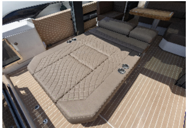
Luxurious seating area on 2024 Saxdor 400 GTO yacht with quilted upholstery.