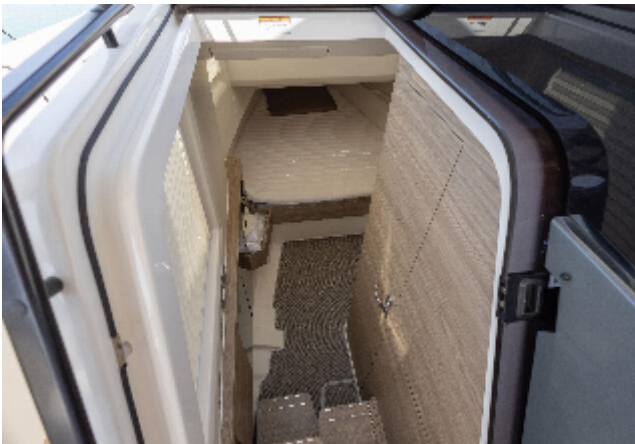
2024 Saxdor 400 GTO cabin interior with modern wood finish and cozy sleeping area.