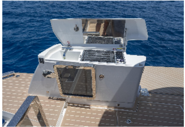
2024 Saxdor 400 GTO yacht with outdoor kitchen and grill on deck.