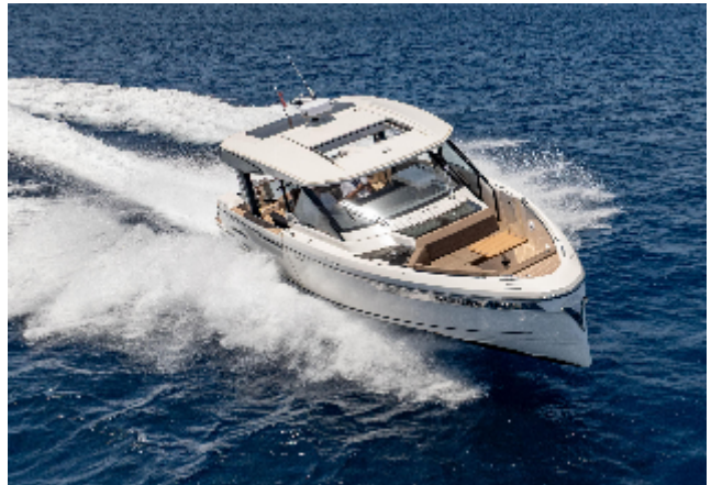
2024 Saxdor 400 GTO cruising on open sea, showcasing sleek design and performance.