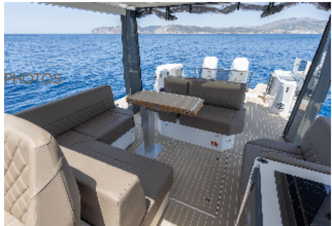
2024 Saxdor 400 GTO luxury yacht interior with seating and table, overlooking the ocean.

2024 Saxdor 400 GTO luxury yacht interior with seating and ocean view.