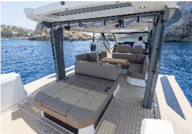
2024 Saxdor 400 GTO luxury yacht interior with seating, table, and ocean view.