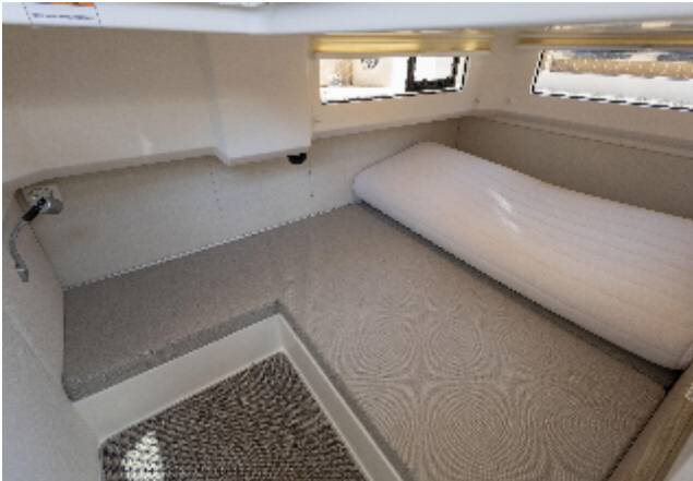
Saxdor 400 For Sale