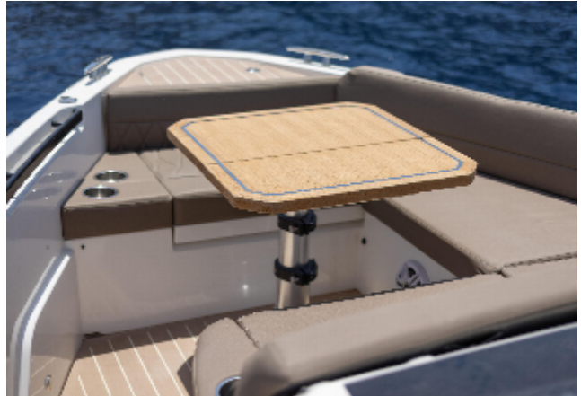
2024 Saxdor 400 GTO boat interior with wooden table and cushioned seating.