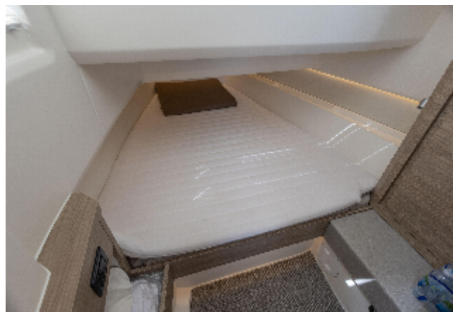
Saxdor 400 For Sale