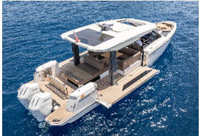
2024 Saxdor 400 GTO luxury boat on open water, featuring twin Mercury engines.