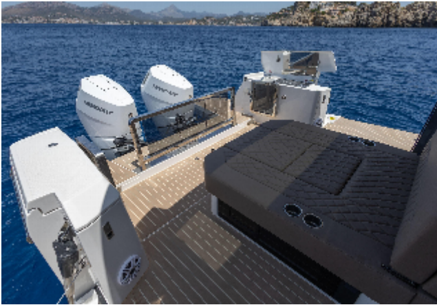
2024 Saxdor 400 GTO boat with twin Mercury engines, spacious deck, and scenic ocean view.