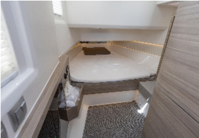
2024 Saxdor 400 GTO cabin interior with modern design and cozy sleeping area.