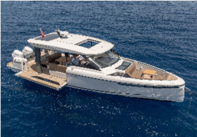
2024 Saxdor 400 GTO luxury boat cruising on open blue sea.