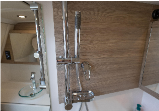
Modern bathroom interior on 2024 Saxdor 400 GTO yacht, featuring sleek fixtures and wood paneling.