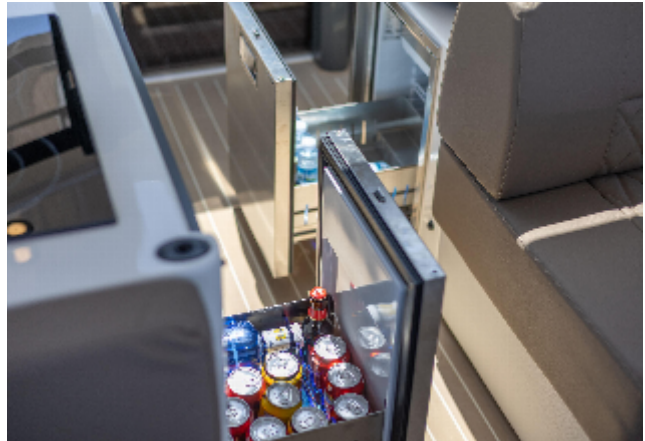
Open fridge on Saxdor 400 GTO yacht, stocked with beverages, 2024 model.

2024 Saxdor 400 GTO yacht interior with kitchenette and ocean view.