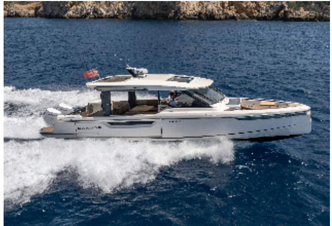
2024 Saxdor 400 GTO cruising on blue ocean waters near rocky coastline.