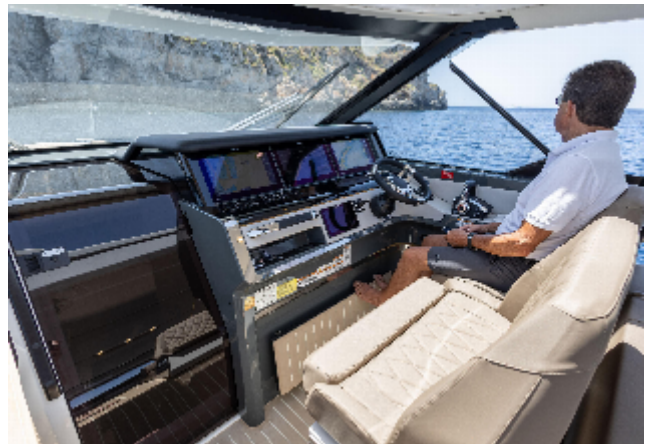
2024 Saxdor 400 GTO cockpit with man steering, featuring modern navigation displays and ocean view.