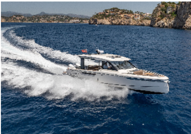
Saxdor 400 For Sale