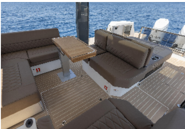
Saxdor 400 For Sale

""json{ "alt_text": "Argo Yachting promises benefits: technical orientation, guarantees, service packs, and end-to-end service."}""