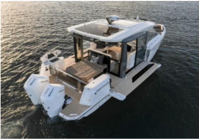
Saxdor 400 GTC For Sale