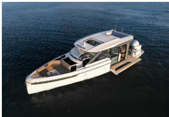
Saxdor 400 GTC For Sale