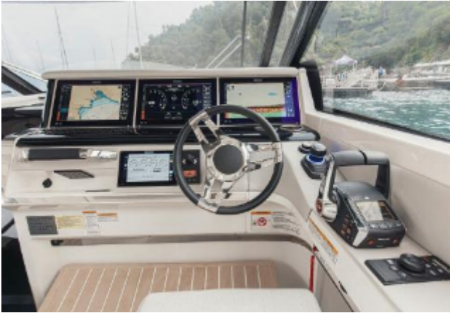
Saxdor 400 GTC For Sale