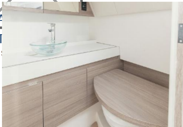
Saxdor 400 GTC For Sale