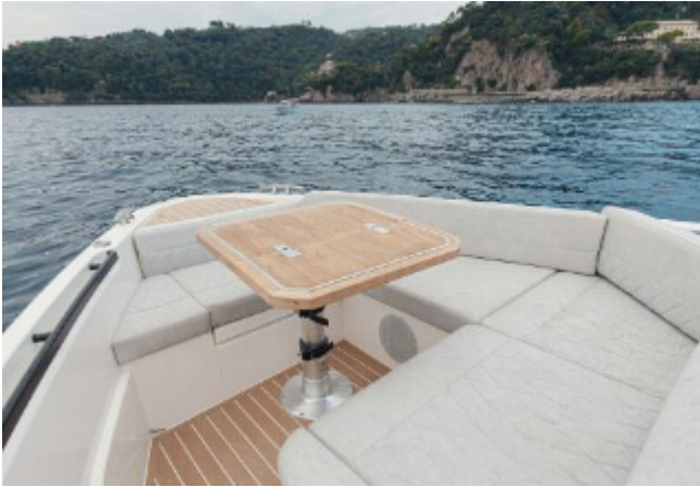
Saxdor 400 GTC For Sale