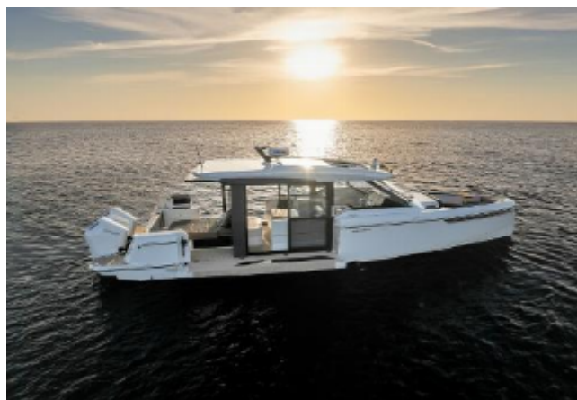
Saxdor 400 GTC For Sale