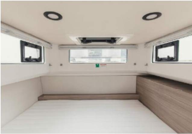
Saxdor 400 GTC For Sale