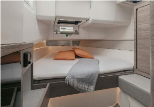
Saxdor 400 GTC For Sale