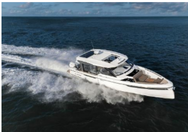
Saxdor 400 GTC For Sale