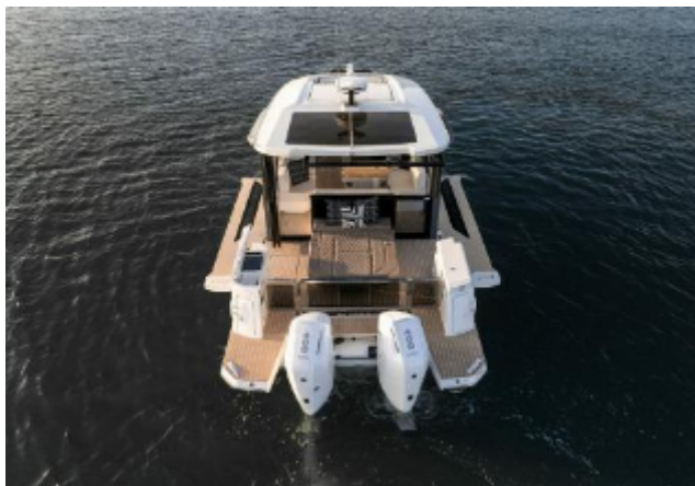
Saxdor 400 GTC For Sale