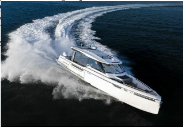
Saxdor 400 GTC For Sale