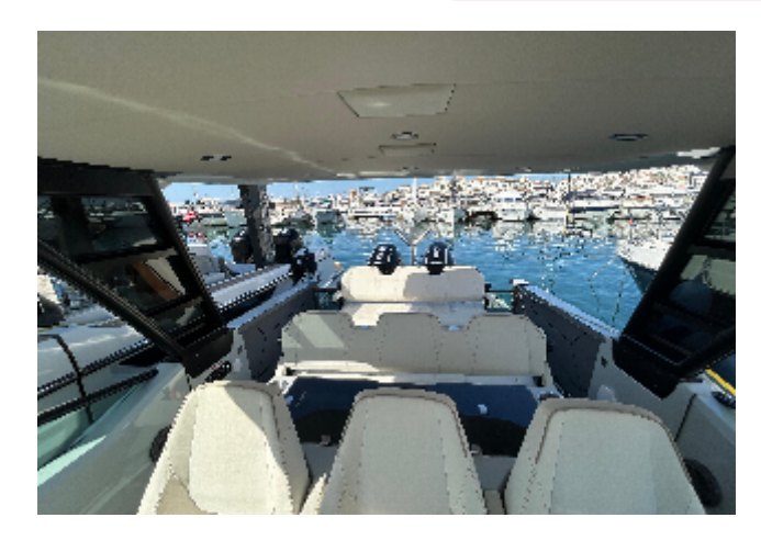
2024 Saxdor 320 GTO boat interior with seating, docked at a marina.

2024 Saxdor 320 GTO boat interior with seating and table, docked in a marina.