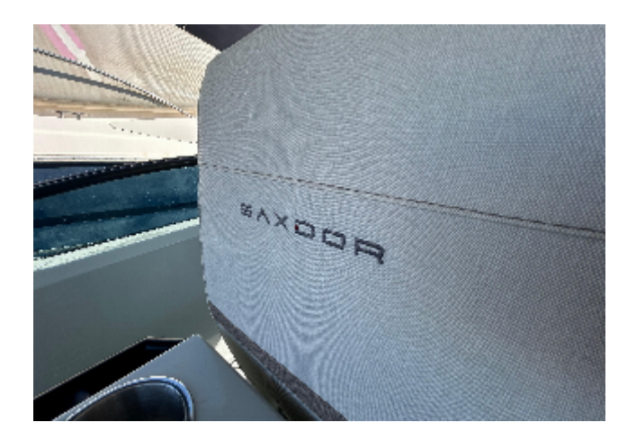
2024 Saxdor 320 GTO interior detail with logo on seat fabric.

2024 Saxdor 320 GTO steering wheel and dashboard, featuring modern controls and sleek design.