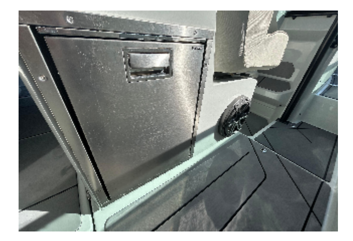
2024 Saxdor 320 GTO interior with stainless steel cabinet and speaker.

2024 Saxdor 320 GTO boat interior with sink and cup holders in cockpit area.