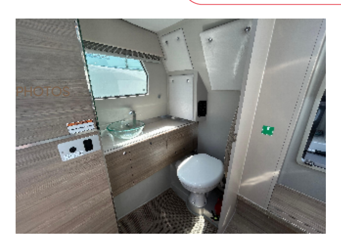
2024 Saxdor 320 GTO bathroom with modern sink, toilet, and wood accents.

REF: AD0916 2024 Saxdor 320 GTO cabin interior with skylights and modern furnishings.