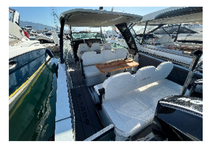
2024 Saxdor 320 GTO luxury boat interior with white seating and wooden table.

Argo Yachting pre-owned services with warranty, extended packs, and comprehensive yacht care.