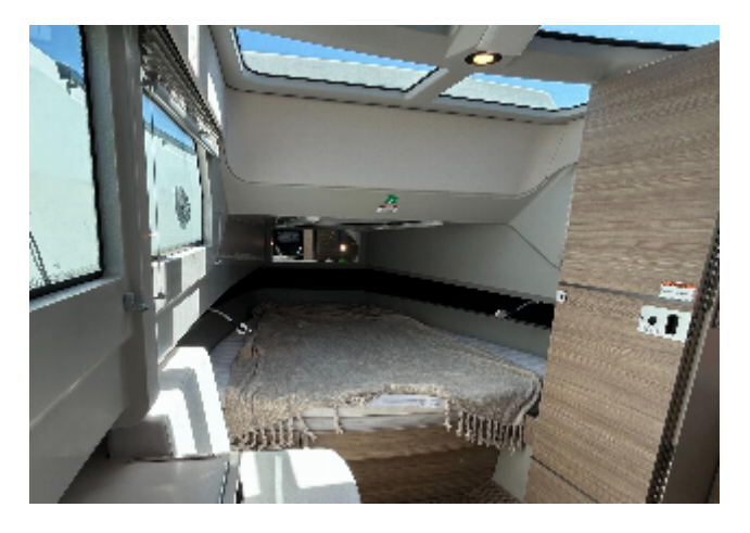
2024 Saxdor 320 GTO cabin interior with bed, skylight, and modern design.