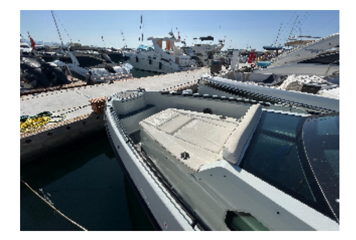
2024 Saxdor 320 GTO docked at marina, showcasing sleek design and spacious seating.

2024 Saxdor 320 GTO boat docked in a marina, reflecting on calm water.