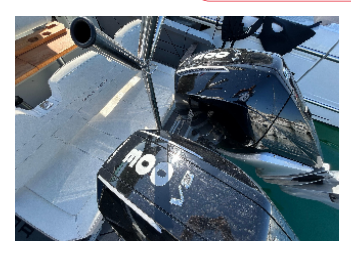
2024 Saxdor 320 GTO boat with dual Mercury outboard engines, docked in sunlight.

2024 Saxdor 320 GTO in marina, showcasing sleek design and powerful engines.