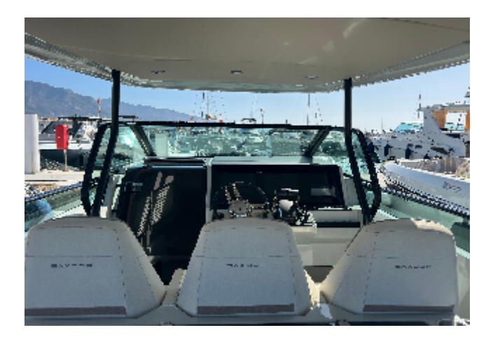
2024 Saxdor 320 GTO boat interior with helm and seating, docked at marina.

2024 Saxdor 320 GTO interior with modern helm and luxurious seating at a marina.