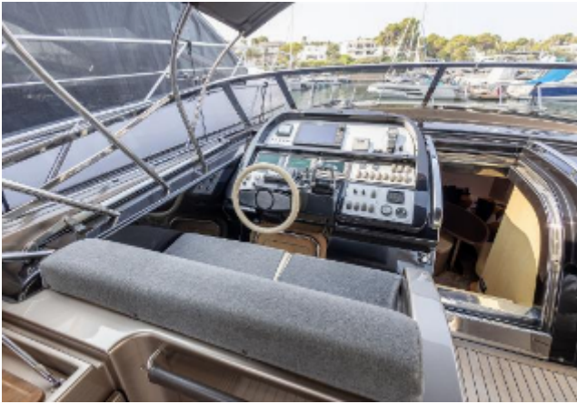
Riva Rivale 52 For Sale