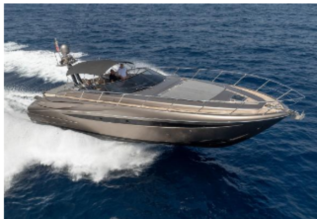
Riva Rivale 52 For Sale