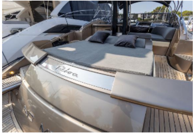
Riva Rivale 52 For Sale