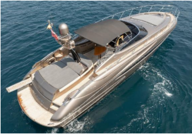
Riva Rivale 52 For Sale