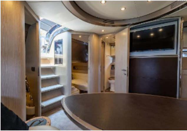
Riva Rivale 52 For Sale