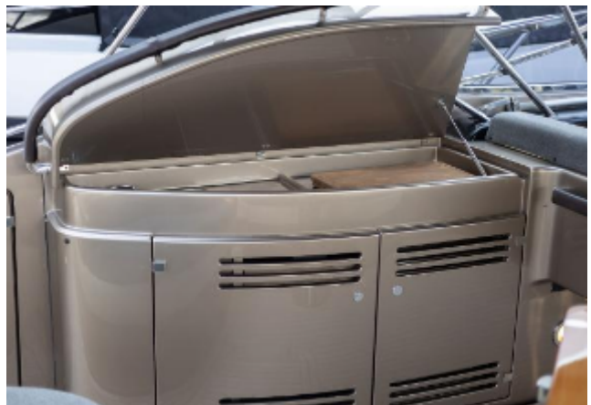
Riva Rivale 52 For Sale