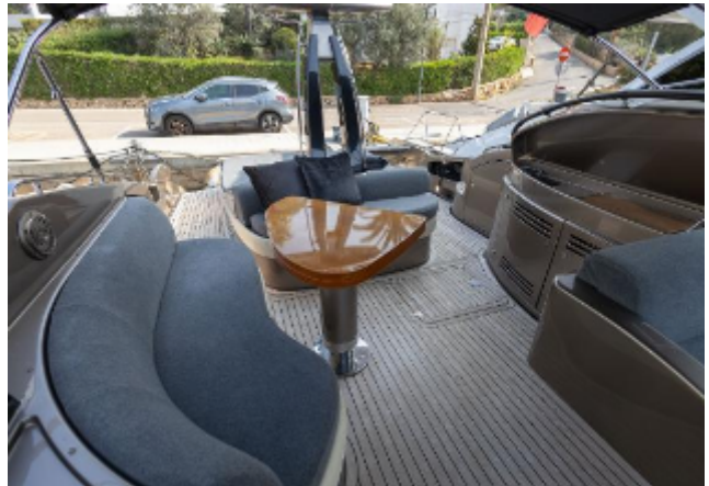
Riva Rivale 52 For Sale