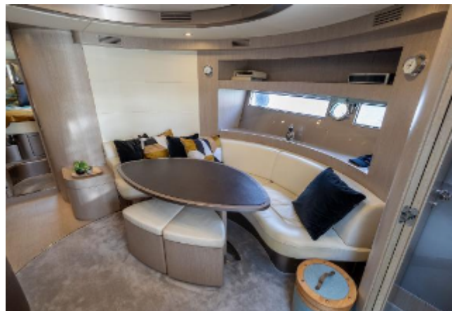
Riva Rivale 52 For Sale