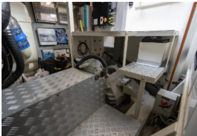
Riva Rivale 52 For Sale