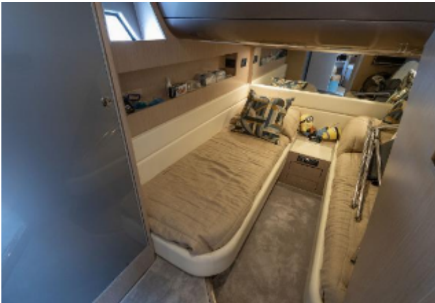
Riva Rivale 52 For Sale