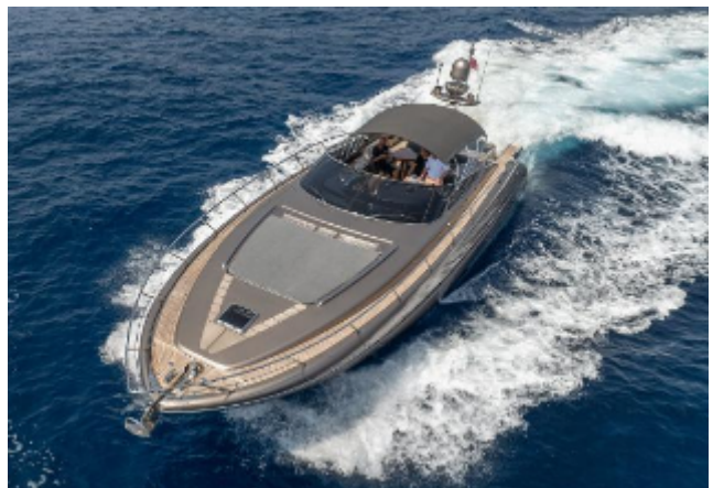
Riva Rivale 52 For Sale