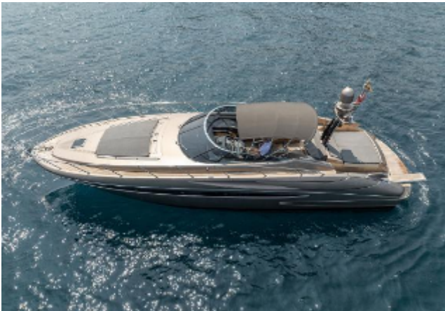
Riva Rivale 52 For Sale