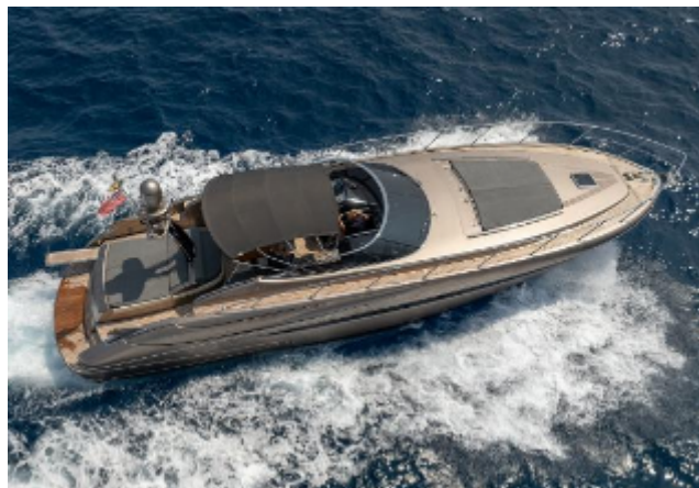
Riva Rivale 52 For Sale