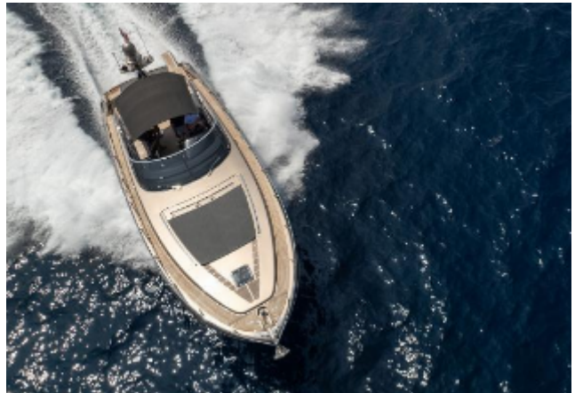
Riva Rivale 52 For Sale