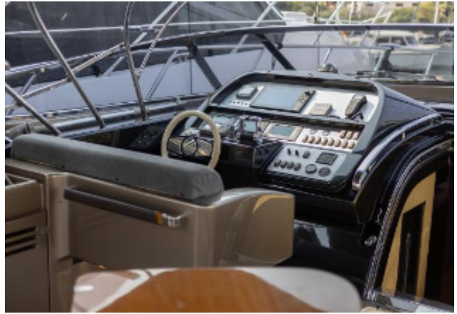
Riva Rivale 52 For Sale