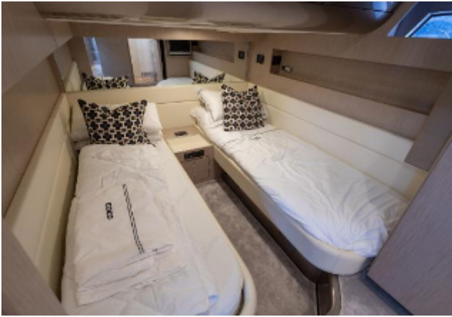
Riva Rivale 52 For Sale