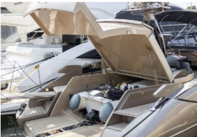
Riva Rivale 52 For Sale