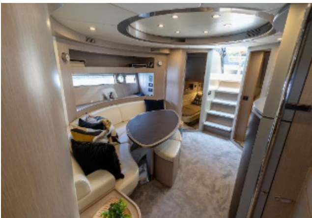
Riva Rivale 52 For Sale