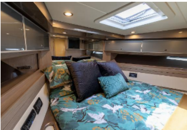
Riva Rivale 52 For Sale