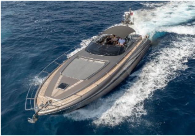
Riva Rivale 52 For Sale