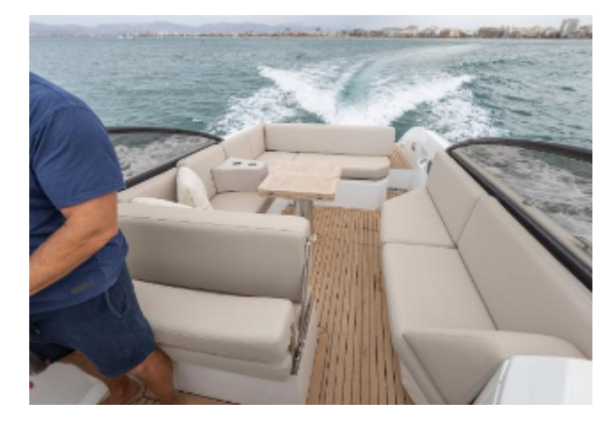
Rand 27 Supreme For Sale