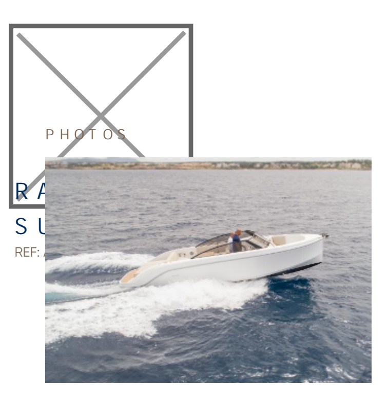
Rand 27 Supreme For Sale