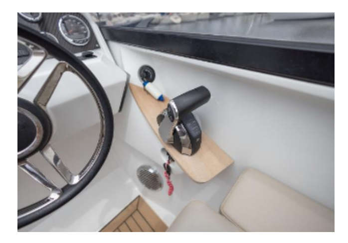
Rand 27 Supreme For Sale