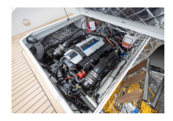
Rand 27 Supreme For Sale