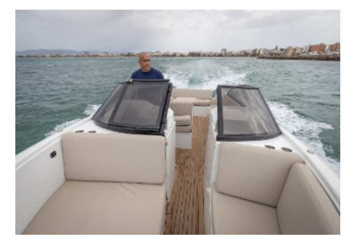
Rand 27 Supreme For Sale