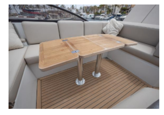
Rand 27 Supreme For Sale