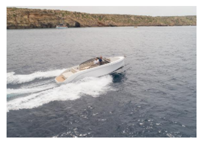
Rand 27 Supreme For Sale