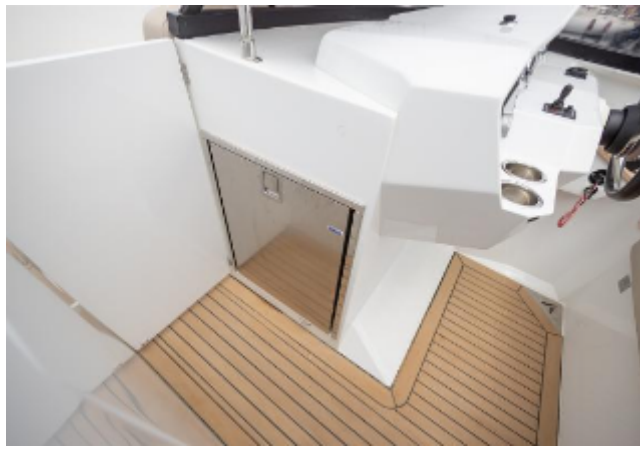
Rand 27 Supreme For Sale