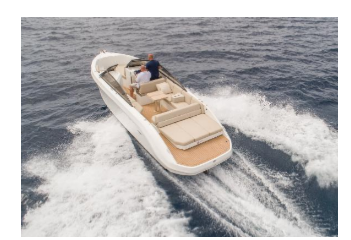
Rand 27 Supreme For Sale