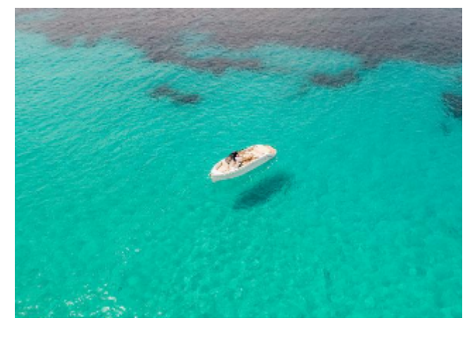
Rand 27 Supreme For Sale