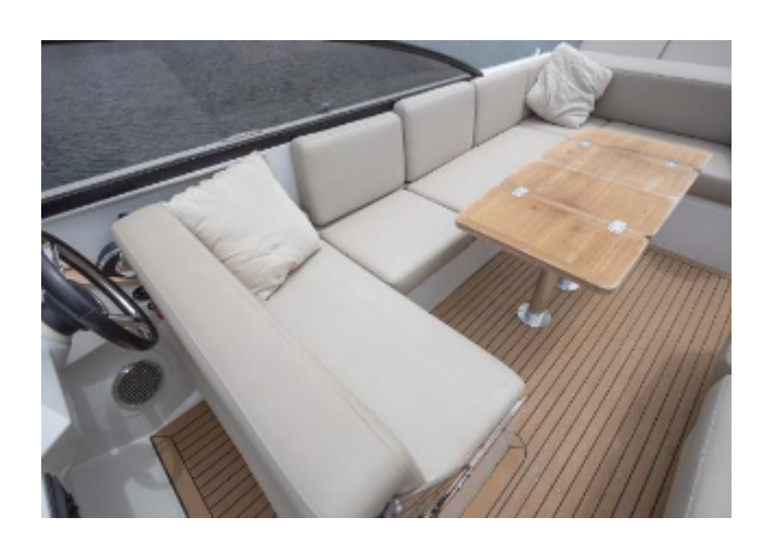
Rand 27 Supreme For Sale