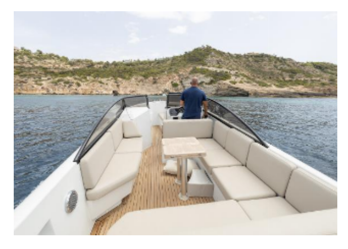
Rand 27 Supreme For Sale