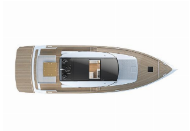
Manufacturer Provided Image: Manufacturer Provided Image