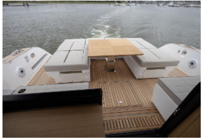
Pardo GT52 For Sale