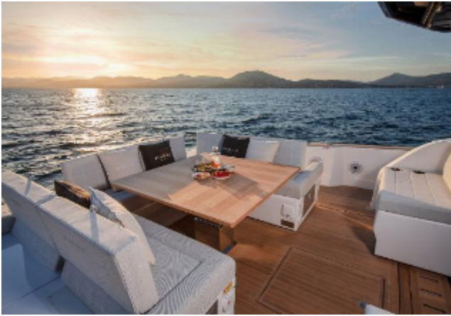
Pardo Yachts GT52 For Sale