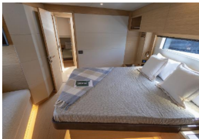
Pardo GT52 For Sale