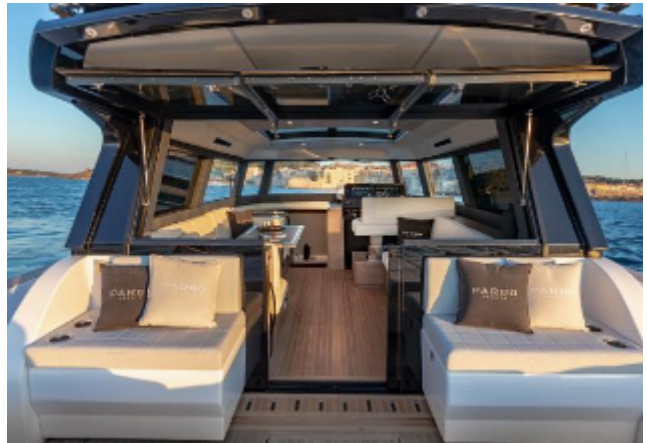
Pardo Yachts GT52 For Sale