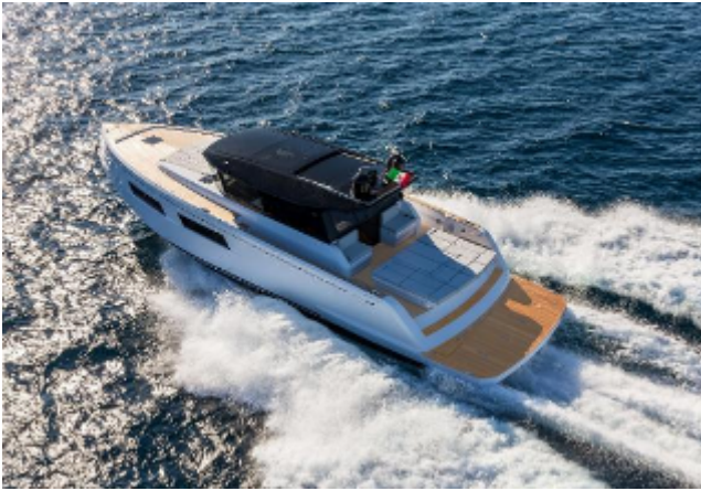
Pardo Yachts GT52 For Sale