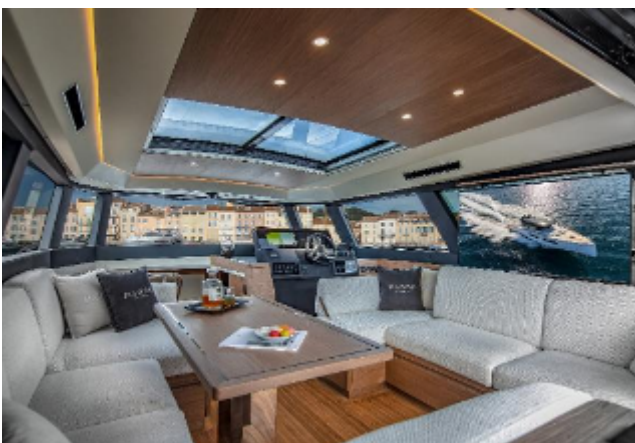
Pardo Yachts GT52 For Sale - Saloon