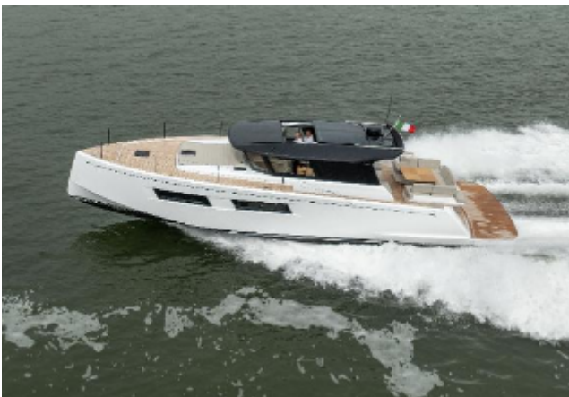
Pardo GT52 For Sale