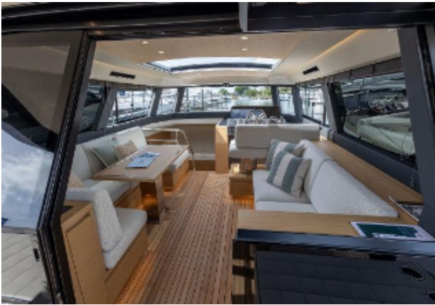
Pardo GT52 For Sale