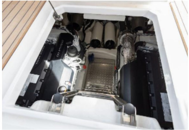
Pardo GT52 For Sale