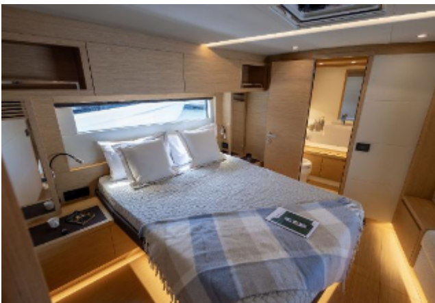
Pardo GT52 For Sale