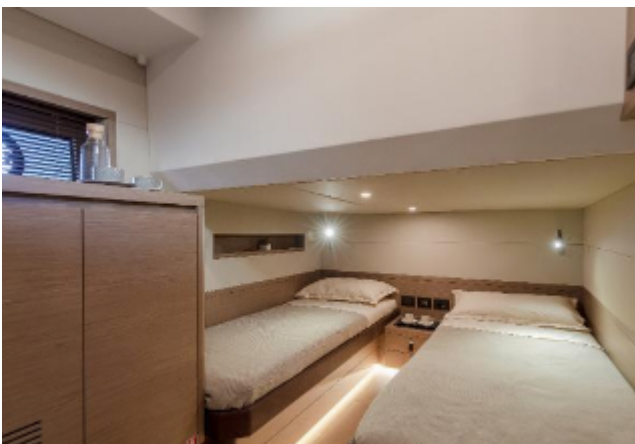
Pardo Yachts GT52 For Sale – Guest Cabin