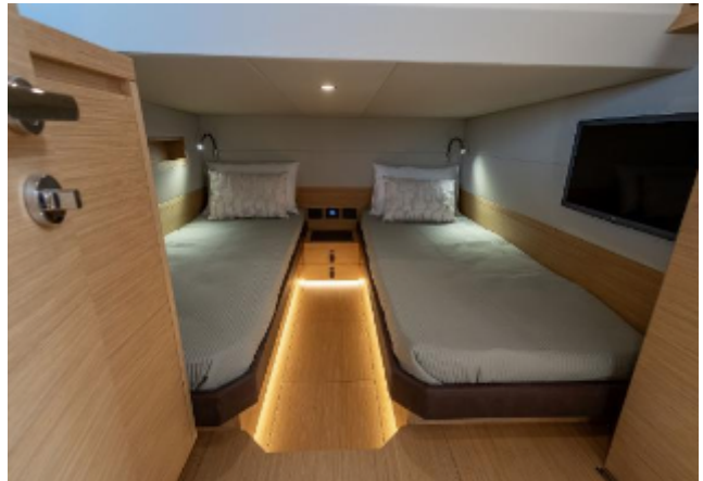
Pardo GT52 For Sale