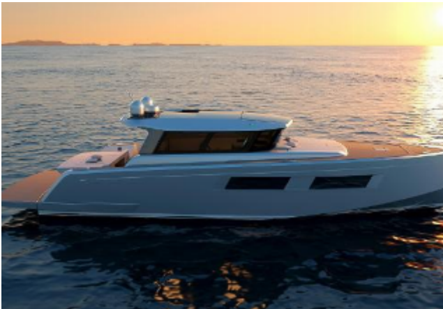
Pardo Yachts GT52 For Sale