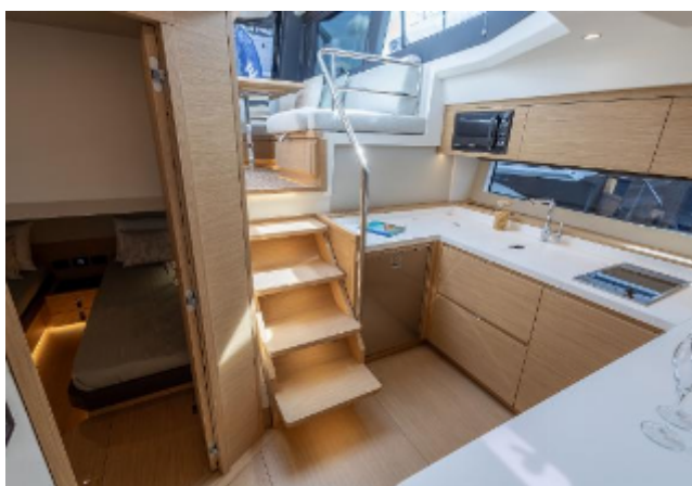
Pardo GT52 For Sale