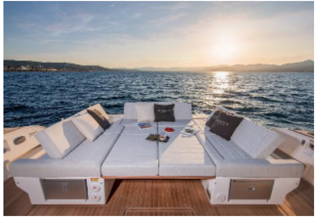
Pardo Yachts GT52 For Sale