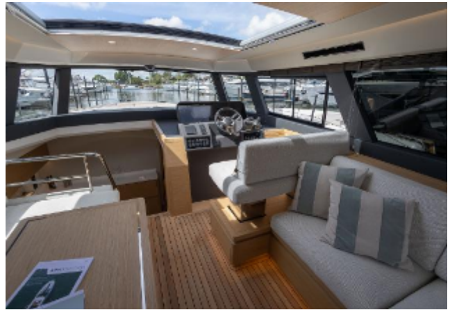
Pardo GT52 For Sale