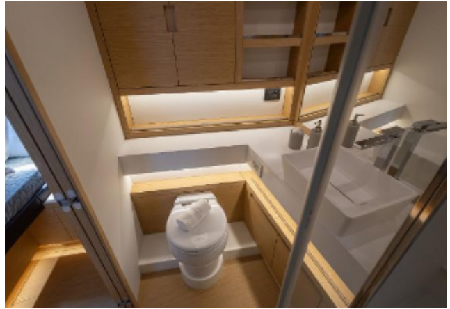
Pardo GT52 For Sale