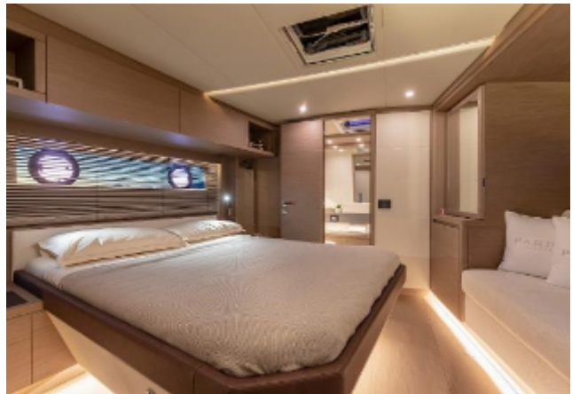
Pardo Yachts GT52 For Sale – Master Cabin