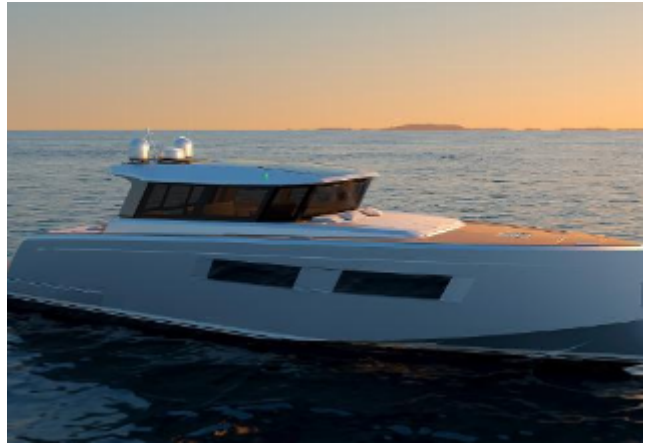
Pardo Yachts GT52 For Sale