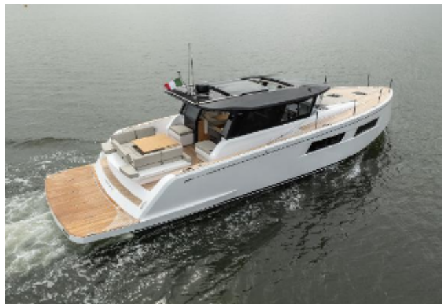
Pardo GT52 For Sale