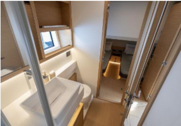
Pardo GT52 For Sale