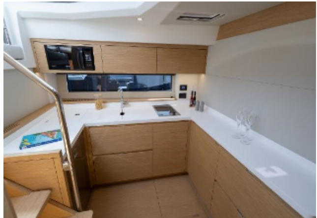
Pardo GT52 For Sale