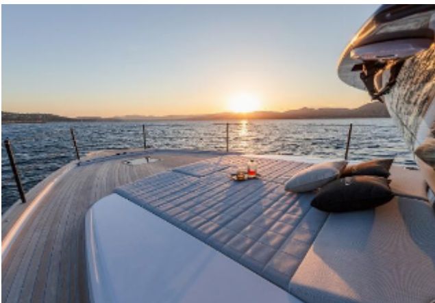
Pardo Yachts GT52 For Sale