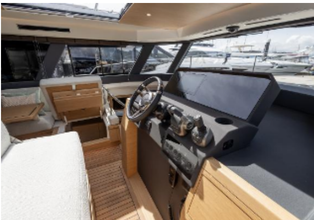
Pardo GT52 For Sale