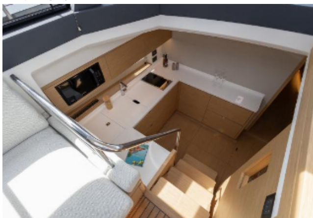
Pardo GT52 For Sale