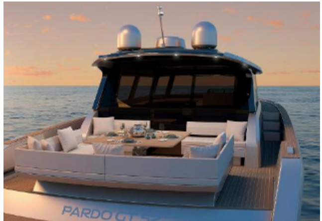
Pardo Yachts GT52 For Sale