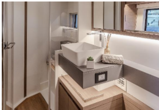
Pardo Yachts GT52 For Sale