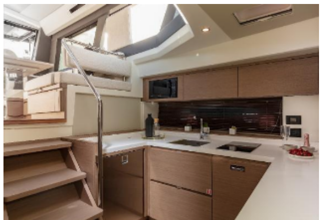
Pardo Yachts GT52 For Sale - Galley