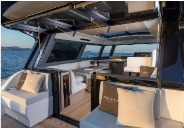
Pardo Yachts GT52 For Sale