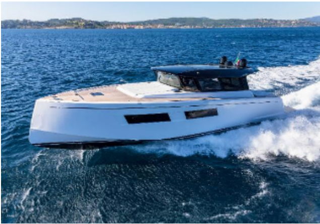
Pardo Yachts GT52 For Sale