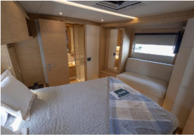
Pardo GT52 For Sale