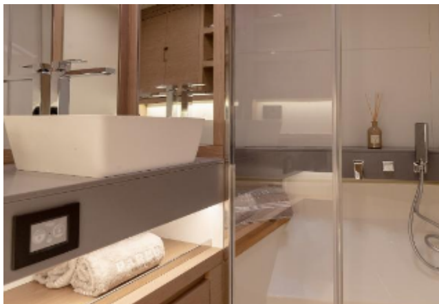
Pardo Yachts GT52 For Sale