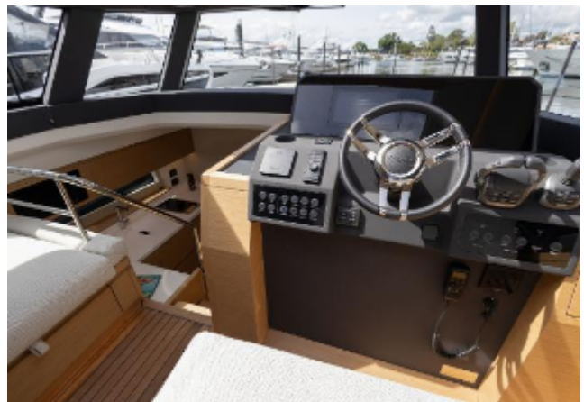
Pardo GT52 For Sale