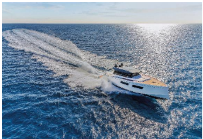
Pardo Yachts GT52 For Sale