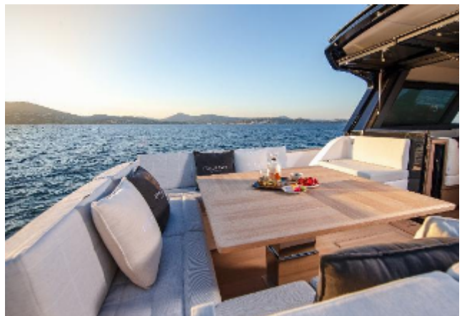
Pardo Yachts GT52 For Sale