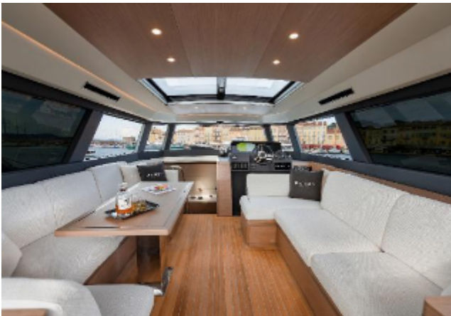
Pardo Yachts GT52 For Sale – Saloon