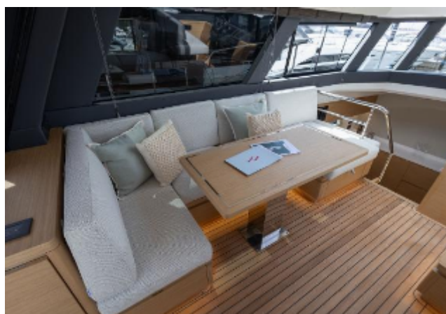
Pardo GT52 For Sale