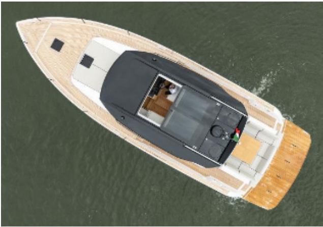
Pardo GT52 For Sale