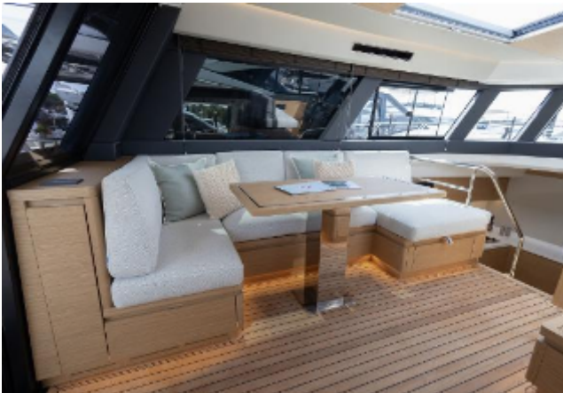
Pardo GT52 For Sale