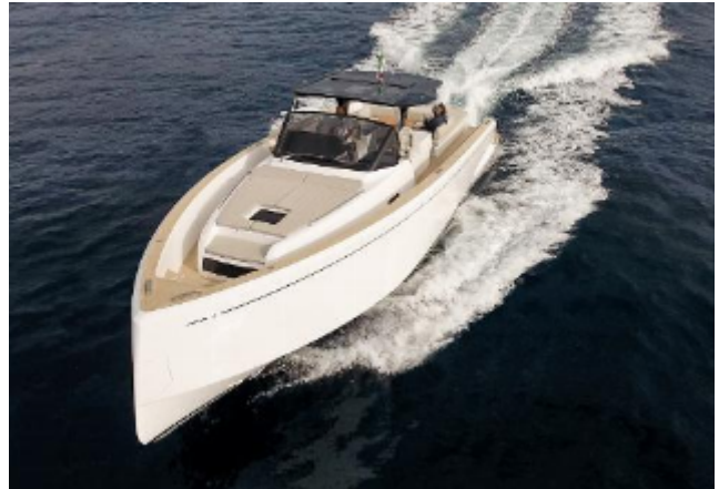
Pardo 50 For Sale