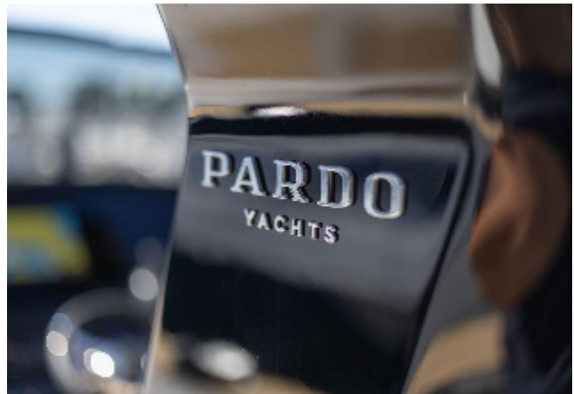
Close-up of 2025 Pardo Yachts 38 logo on sleek surface.