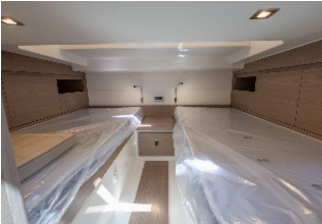
Luxurious cabin interior of 2025 Pardo Yachts 38 with twin beds and modern lighting.