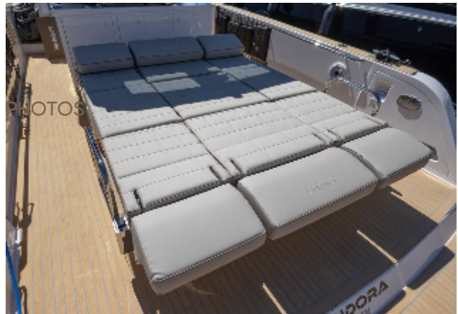
Luxury sunbed on 2025 Pardo Yachts 38, featuring sleek design and comfortable seating.

Luxurious seating area on 2025 Pardo Yachts 38 with elegant wooden table.