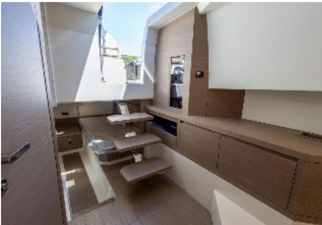
Interior of 2025 Pardo Yachts 38, featuring modern wood finishes and sleek design elements.