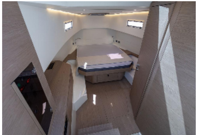
Luxurious interior of 2025 Pardo Yachts 38, featuring modern design and cozy sleeping area.