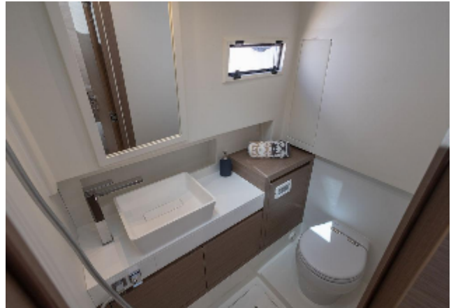
Modern bathroom interior of 2025 Pardo Yachts 38, featuring sleek sink and compact toilet.