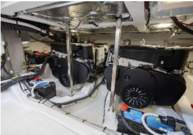
Engine room of 2025 Pardo Yachts 38, showcasing dual engines and wiring.