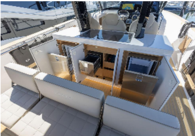
Luxurious 2025 Pardo Yachts 38 interior with open storage and seating area.