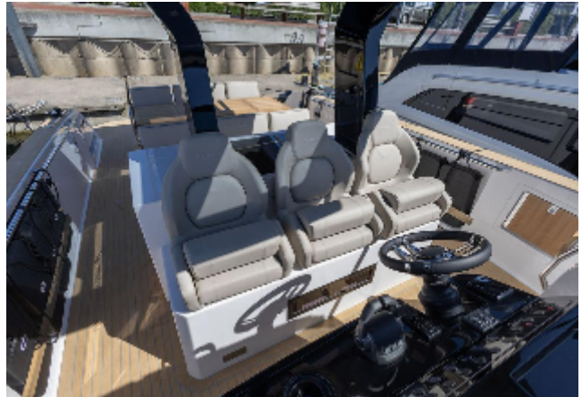
Luxury interior of 2025 Pardo Yachts 38, featuring sleek helm and comfortable seating.

Helm of 2025 Pardo Yachts 38 featuring modern navigation and control systems.