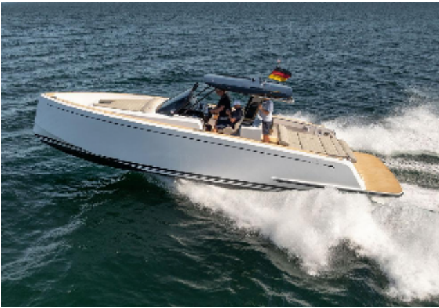
2025 Pardo Yachts 38 cruising on open water, showcasing sleek design and performance.