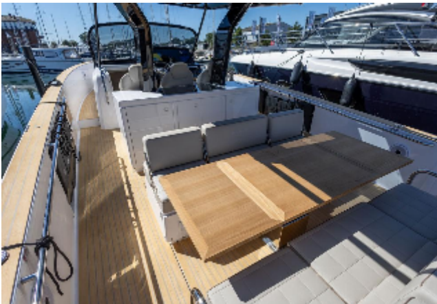
2025 Pardo Yachts 38 interior with seating and wooden table in a marina setting.