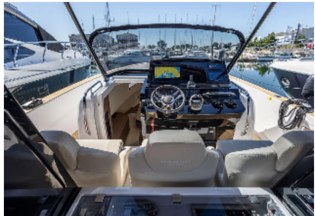
2025 Pardo Yachts 38 cockpit with modern navigation system and luxurious seating.