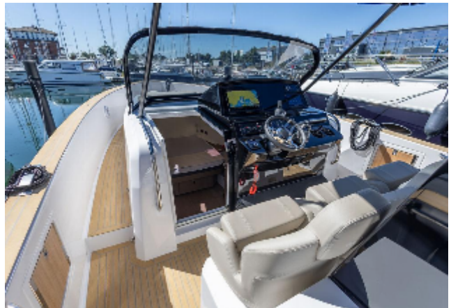
2025 Pardo Yachts 38 cockpit with modern navigation system and luxurious seating.