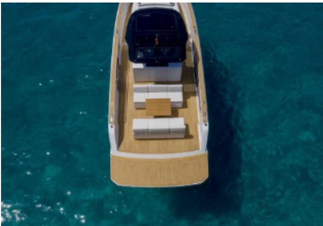
Pardo 38 For Sale