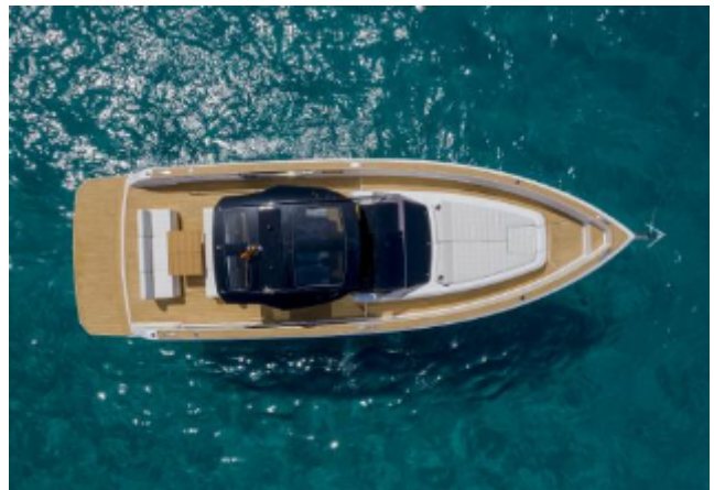
Pardo 38 For Sale