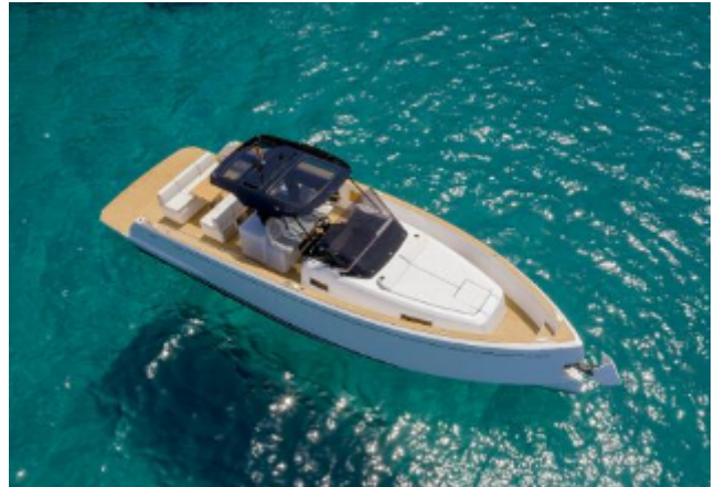
Pardo 38 For Sale