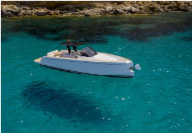
Pardo 38 For Sale