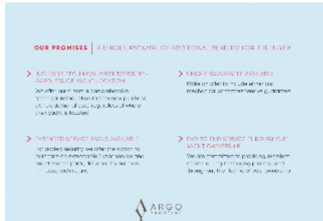
Alt text: "Hanse 388 2021 yacht benefits: technical orientation, unique guarantee, service packs, end-to-end service."