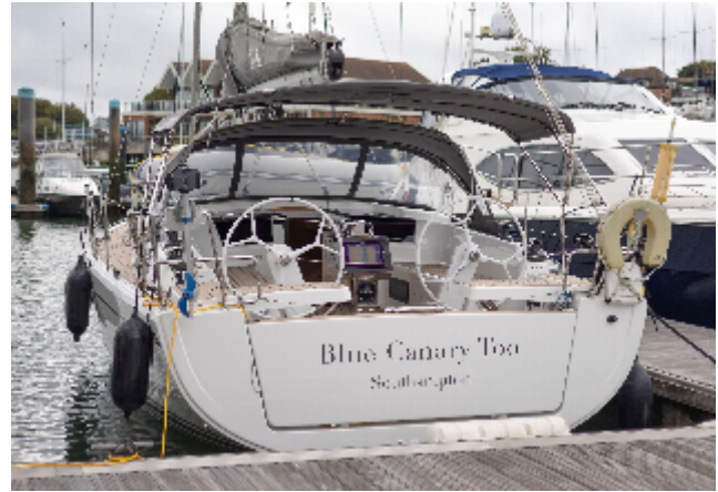
2021 Hanse 388 sailboat docked in marina, named "Blue Canary Too," Southampton.