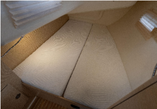
Interior cabin of 2021 Hanse 388 yacht with twin beds and modern design.