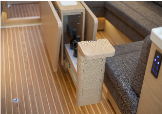
Interior of 2021 Hanse 388 yacht with modern wood cabinetry and seating.