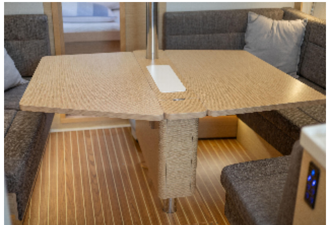
Interior of 2021 Hanse 388 yacht with wooden table and cushioned seating.