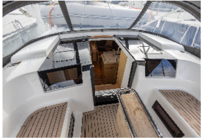
2021 Hanse 388 yacht cockpit with open cabin entrance and sleek design.