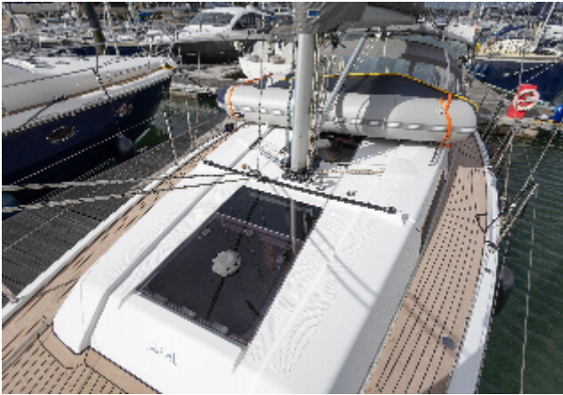
2021 Hanse 388 sailboat docked, featuring a sleek deck and inflatable dinghy.