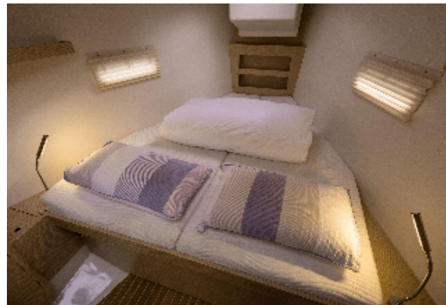
Cozy cabin interior of 2021 Hanse 388 yacht with soft lighting and striped pillows.