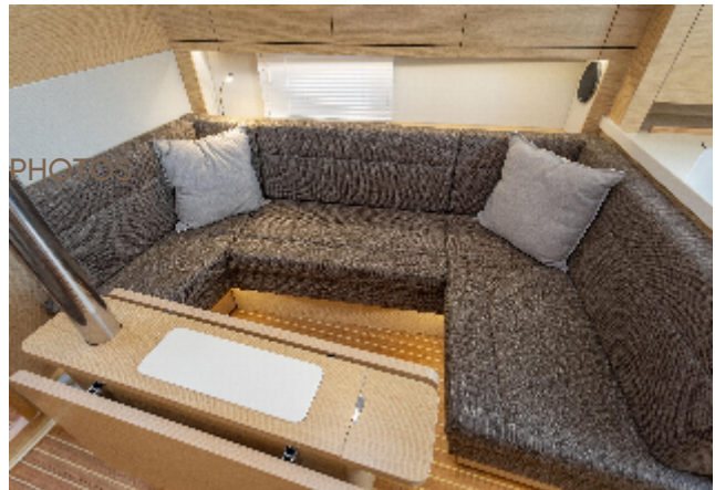
Modern interior of 2021 Hanse 388 yacht with cozy gray seating area.

Interior of 2021 Hanse 388 yacht with cozy seating and modern design.