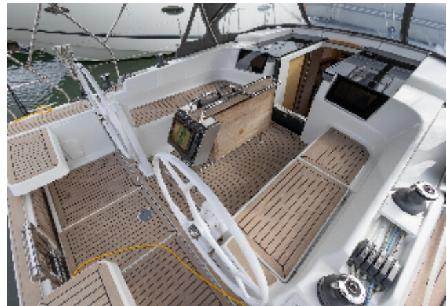
2021 Hanse 388 yacht cockpit with teak flooring and dual steering wheels.