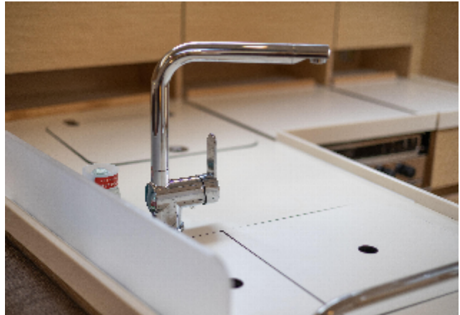
Modern kitchen sink in 2021 Hanse 388 yacht, featuring sleek chrome faucet and minimalist design.

Modern interior of 2021 Hanse 388 yacht with sleek kitchen and wooden flooring.