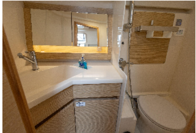
Modern bathroom in 2021 Hanse 388 yacht with sink, mirror, and toilet.