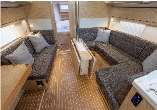
Interior of 2021 Hanse 388 yacht with modern seating and wooden flooring.