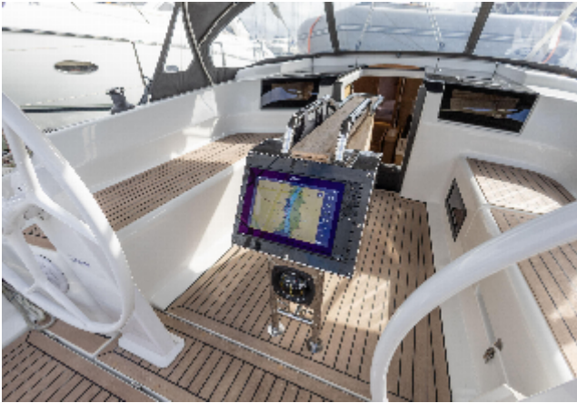
Cockpit of 2021 Hanse 388 yacht with navigation system and wooden deck.