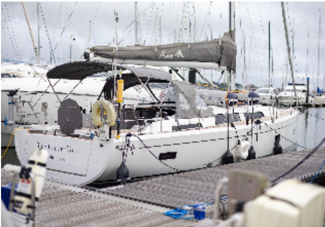
2021 Hanse 388 sailboat docked at marina, featuring sleek design and modern amenities.