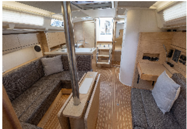
Modern interior of 2021 Hanse 388 yacht with cozy seating and sleek design.