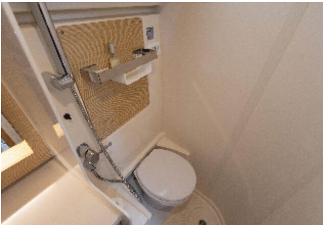
2021 Hanse 388 yacht bathroom with shower, toilet, and modern fixtures.