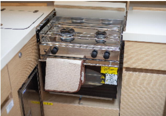
Modern kitchen stove in 2021 Hanse 388 yacht interior, featuring dual burners and sleek design.