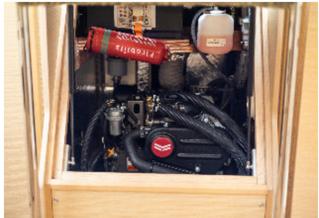
Engine compartment of 2021 Hanse 388 yacht with visible fire extinguisher and components.