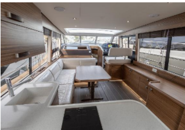
Greenline 40 Hybrid Motor Yacht For Sale