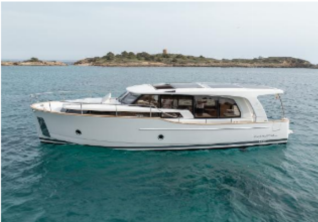
Greenline 40 Hybrid Motor Yacht For Sale