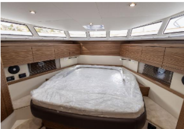
Greenline 40 Hybrid Motor Yacht For Sale