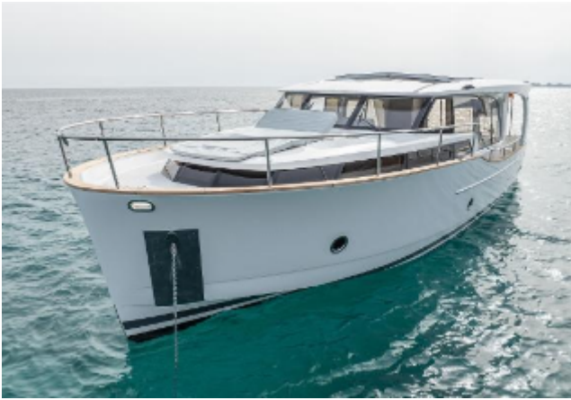
Greenline 40 Hybrid Motor Yacht For Sale