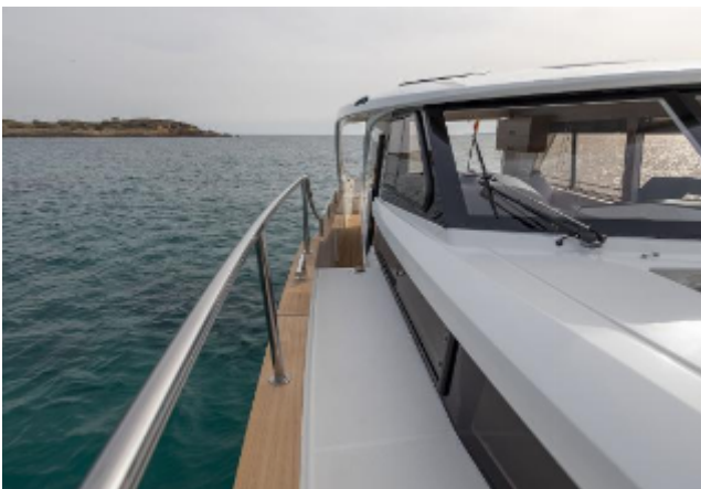
Greenline 40 Hybrid Motor Yacht For Sale