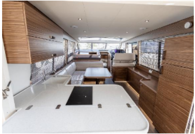
Greenline 40 Hybrid Motor Yacht For Sale