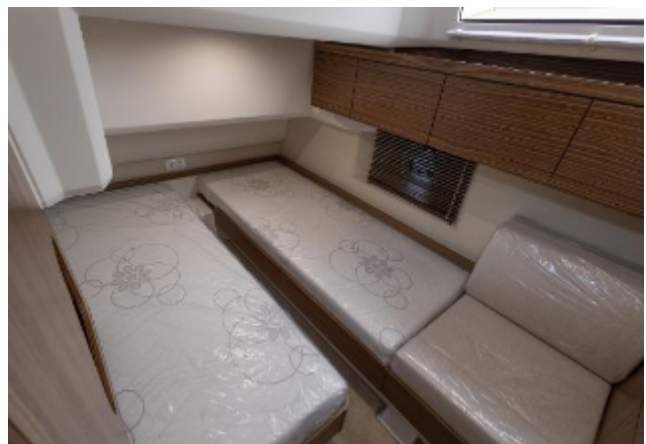
Greenline 40 Hybrid Motor Yacht For Sale