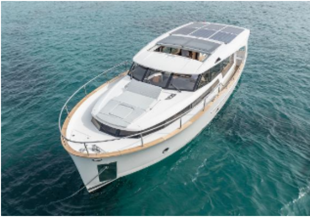
Greenline 40 Hybrid Motor Yacht For Sale