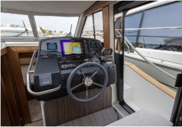
Greenline 40 Hybrid Motor Yacht For Sale