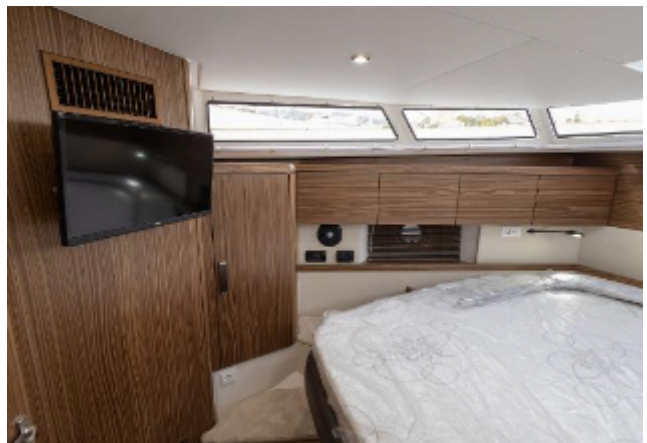
Greenline 40 Hybrid Motor Yacht For Sale PHOTOS