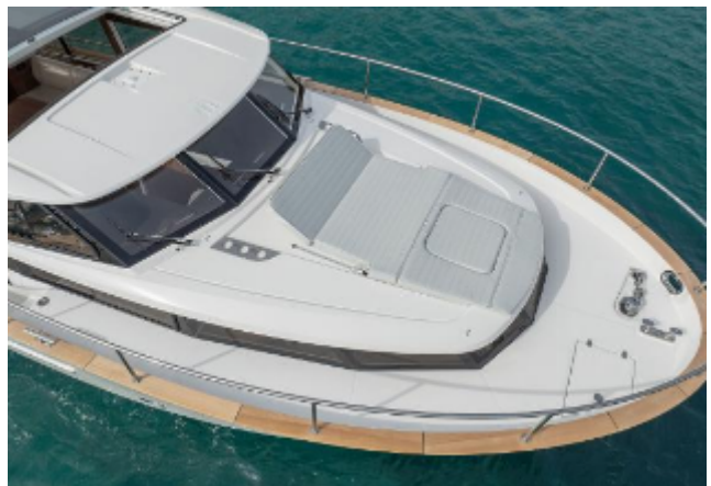
Greenline 40 Hybrid Motor Yacht For Sale