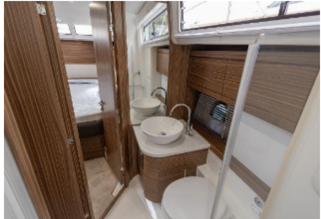
Greenline 40 Hybrid Motor Yacht For Sale