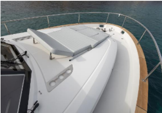
Greenline 40 Hybrid Motor Yacht For Sale