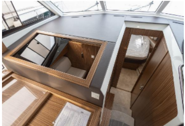
Greenline 40 Hybrid Motor Yacht For Sale