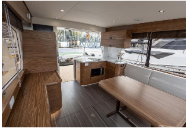
Greenline 40 Hybrid Motor Yacht For Sale