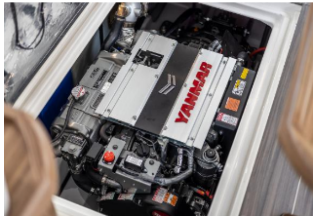
Greenline 40 Hybrid Motor Yacht For Sale