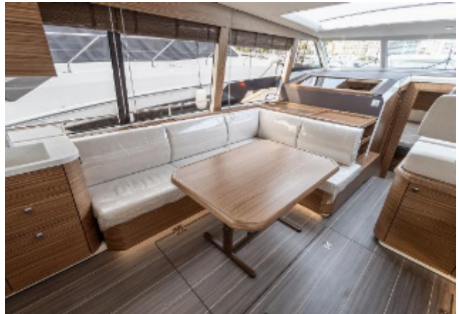
Greenline 40 Hybrid Motor Yacht For Sale