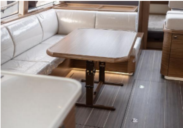
Greenline 40 Hybrid Motor Yacht For Sale