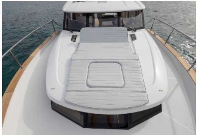
Greenline 40 Hybrid Motor Yacht For Sale