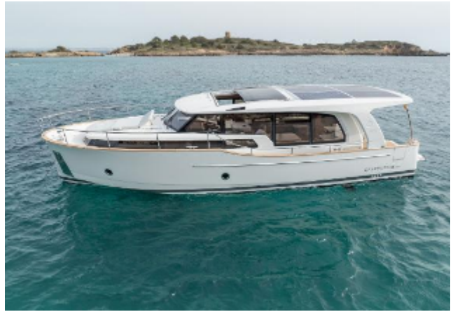
Greenline 40 Hybrid Motor Yacht For Sale