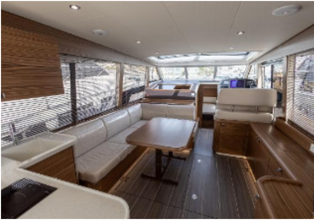
Greenline 40 Hybrid Motor Yacht For Sale