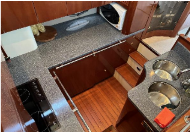
Luxurious 2003 Fairline Squadron 55 yacht kitchen with modern amenities and wooden flooring.