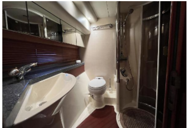
Luxurious bathroom in 2003 Fairline Squadron 55 yacht with modern fixtures and elegant design.