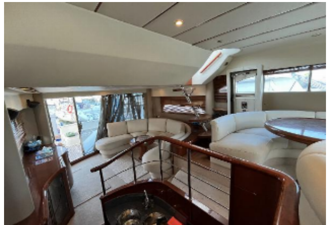
Luxurious interior of 2003 Fairline Squadron 55 yacht with elegant seating and modern design.