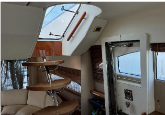
Interior of 2003 Fairline Squadron 55 yacht with modern staircase and seating area.