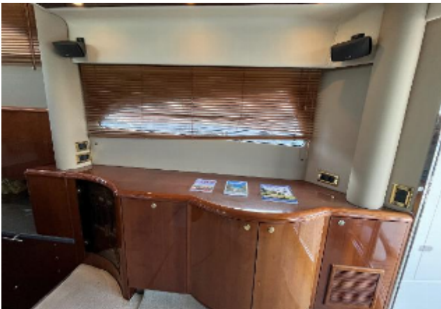
Luxurious interior of 2003 Fairline Squadron 55 yacht with wooden cabinetry and blinds.