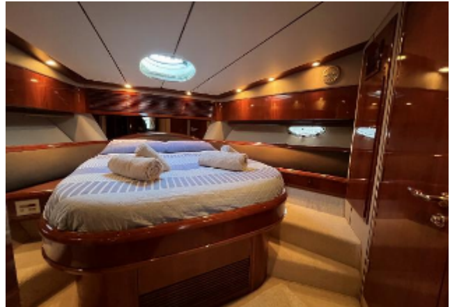
Luxurious cabin interior of 2003 Fairline Squadron 55 yacht with elegant wood finish.

Luxurious cabin interior of 2003 Fairline Squadron 55 yacht with elegant bedding and ambient lighting.