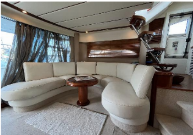
Luxurious interior of 2003 Fairline Squadron 55 yacht with elegant curved seating and wooden accents.