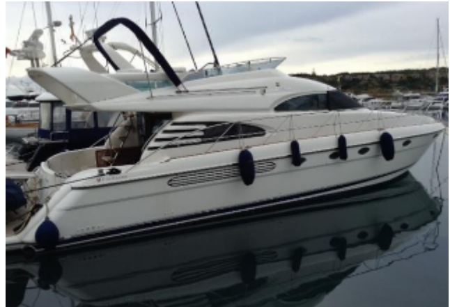
2003 Fairline Squadron 55 yacht docked in a marina, side view.