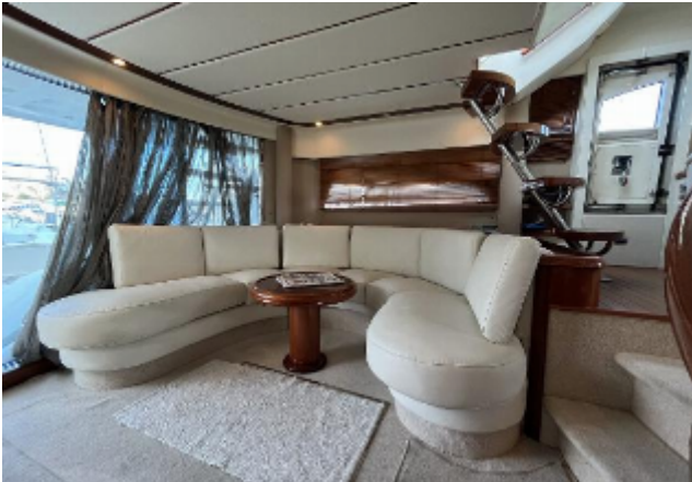
Luxurious interior of 2003 Fairline Squadron 55 yacht with elegant seating and wooden accents.