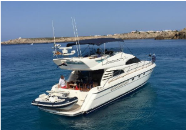
2003 Fairline Squadron 55 yacht on calm blue waters near rocky coastline.