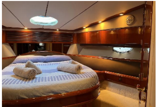
Luxurious cabin interior of 2003 Fairline Squadron 55 yacht with elegant wood finishes.