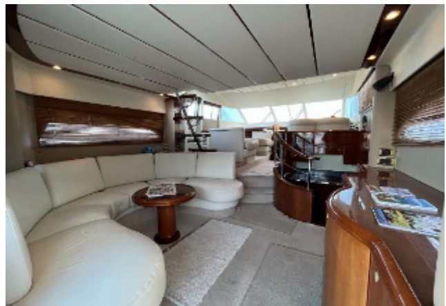
Luxurious interior of 2003 Fairline Squadron 55 yacht with elegant seating and modern design.