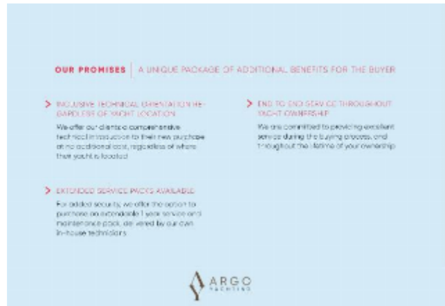
Fairline Squadron 55 2003 yacht benefits: technical orientation, end-to-end service, extended service packs.