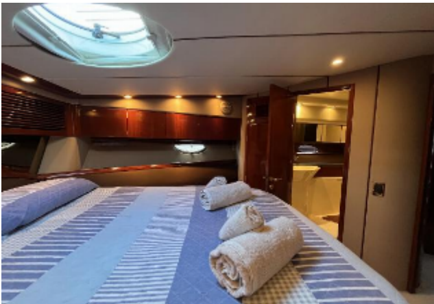
Luxurious cabin interior of 2003 Fairline Squadron 55 yacht with striped bedding and towels.