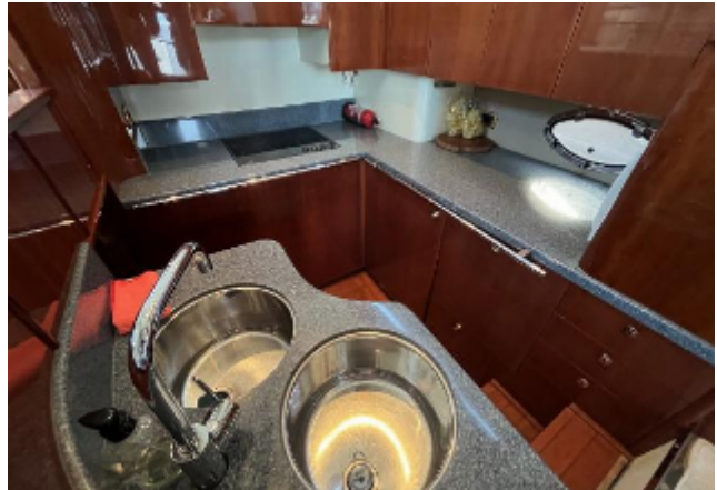
Luxurious kitchen interior of 2003 Fairline Squadron 55 yacht with modern amenities.