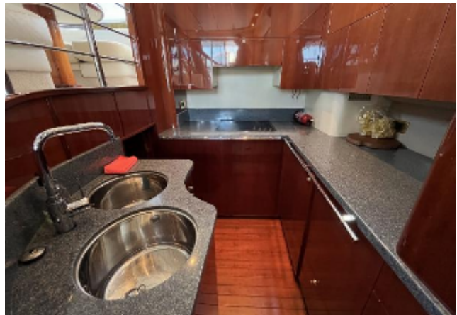
Luxurious kitchen in 2003 Fairline Squadron 55 yacht with sleek wood cabinetry and modern appliances.