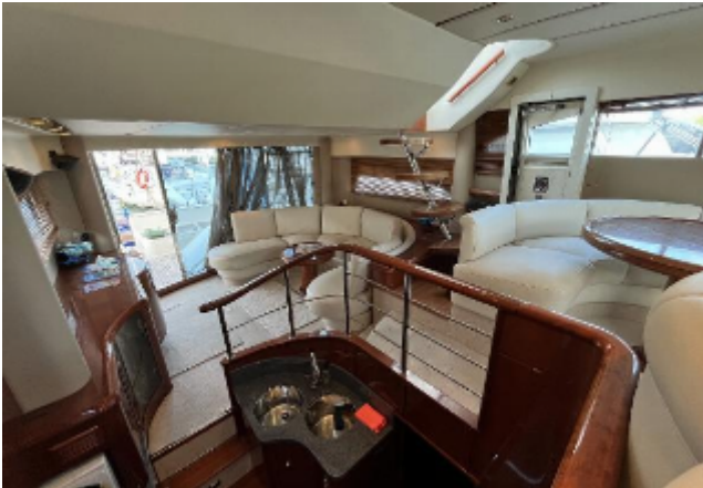
Luxurious interior of 2003 Fairline Squadron 55 yacht with elegant seating and modern amenities.