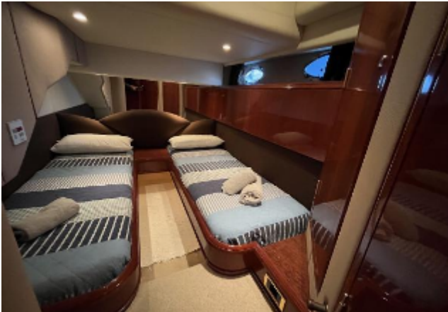
Luxurious twin cabin in 2003 Fairline Squadron 55 yacht with elegant wood finishes.