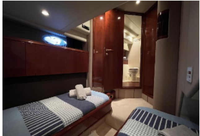
Luxurious cabin interior of 2003 Fairline Squadron 55 yacht with twin beds and ensuite bathroom.