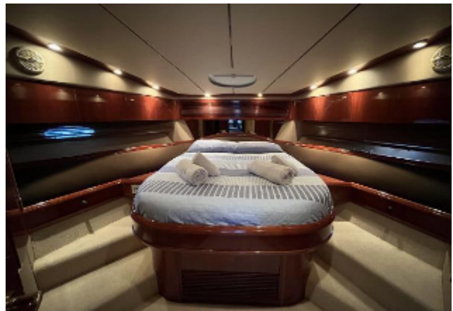
Luxurious cabin interior of 2003 Fairline Squadron 55 yacht with elegant bedding.