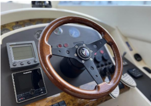
Helm of 2003 Fairline Squadron 55 yacht with wooden steering wheel and navigation instruments.