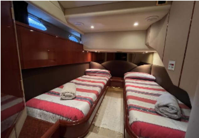
Twin cabin in 2003 Fairline Squadron 55 yacht with striped bedding and ambient lighting.