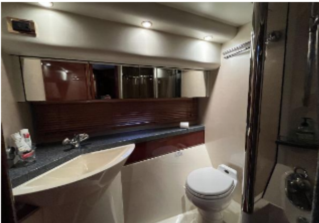
Luxurious bathroom in a 2003 Fairline Squadron 55 yacht, featuring modern fixtures and elegant design.