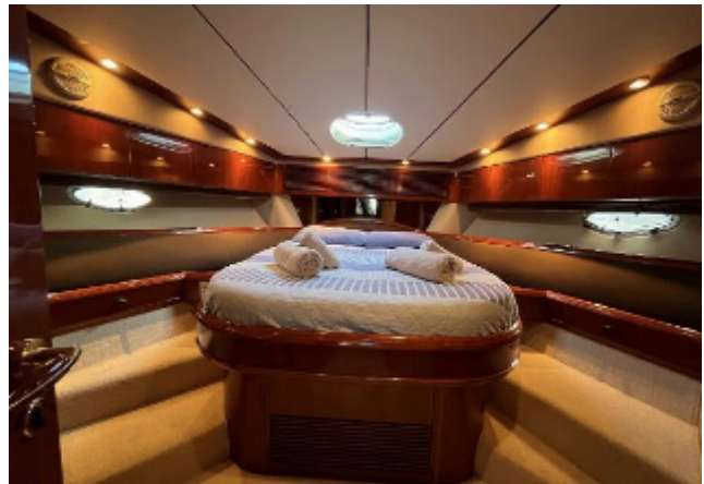
Luxurious cabin interior of 2003 Fairline Squadron 55 yacht with elegant wood finish.