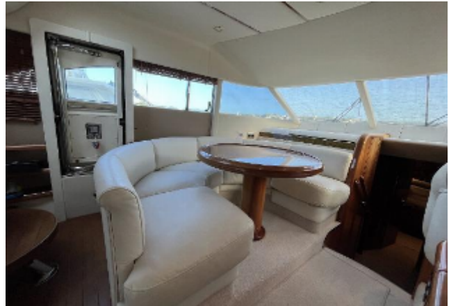
Luxurious interior of 2003 Fairline Squadron 55 yacht with elegant seating and wooden table.