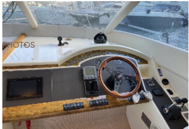
Cockpit of 2003 Fairline Squadron 55 yacht with wooden steering wheel and navigation instruments.

Helm of 2003 Fairline Squadron 55 yacht with leather seats and modern controls.