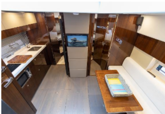
Fairline Squadron 48 For Sale