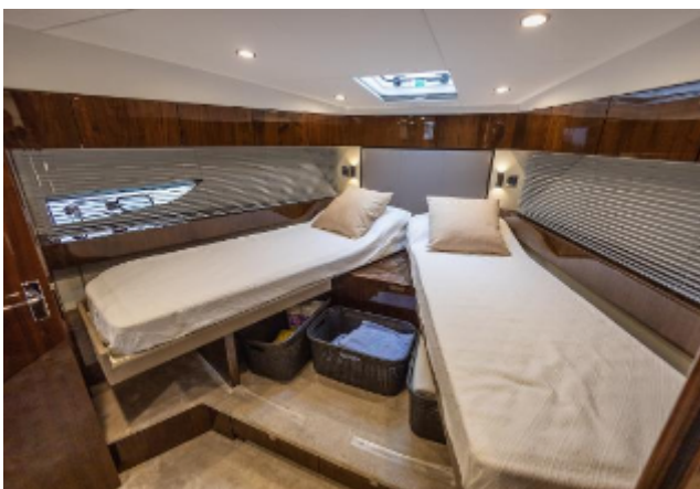
Fairline Squadron 48 For Sale