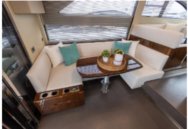
Fairline Squadron 48 For Sale