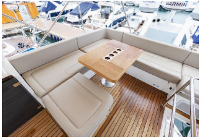
Fairline Squadron 48 For Sale