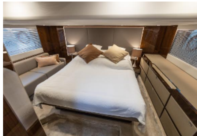
Fairline Squadron 48 For Sale