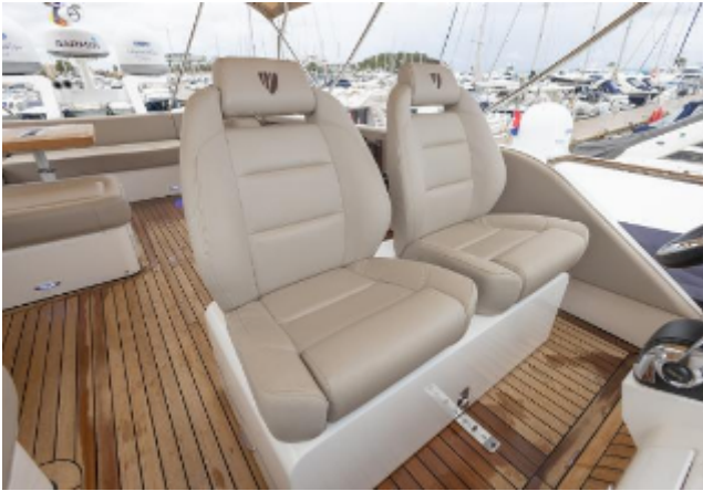
Fairline Squadron 48 For Sale