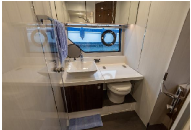
Fairline Squadron 48 For Sale