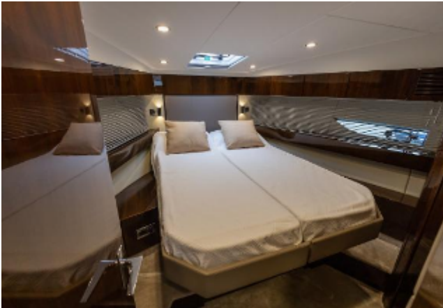
Fairline Squadron 48 For Sale