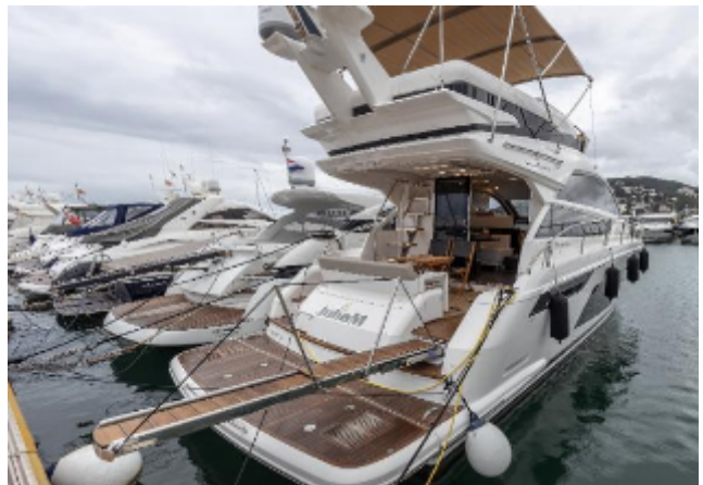
Fairline Squadron 48 For Sale PHOTOS