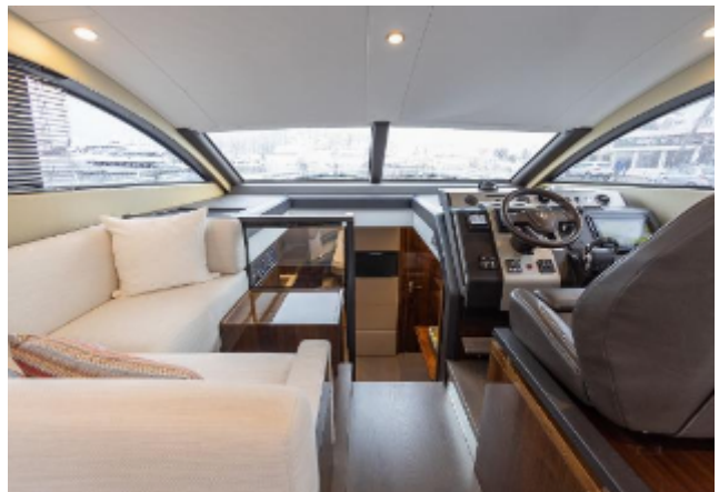
Fairline Squadron 48 For Sale PHOTOS