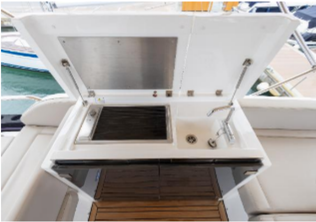
Fairline Squadron 48 For Sale