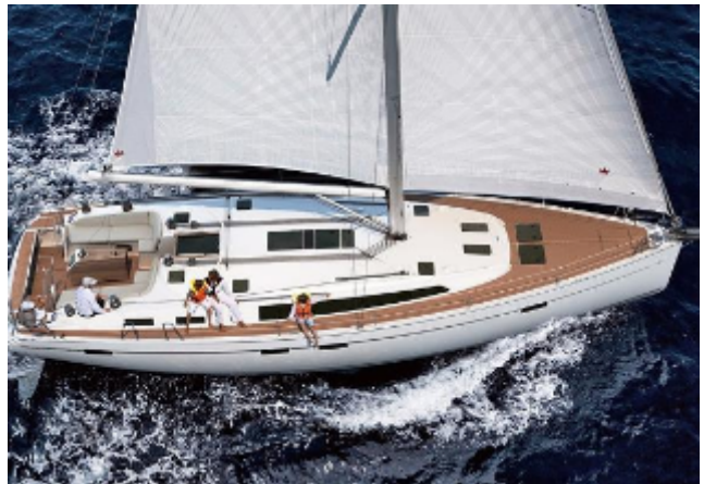
Bavaria Cruiser 51