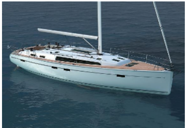
Bavaria Cruiser 51