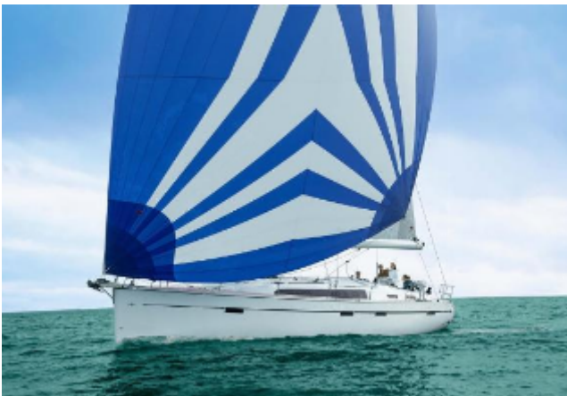
Bavaria Cruiser 51 Sailing