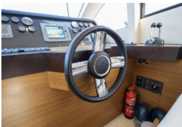
Astondoa 43 GLX For Sale