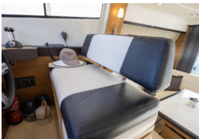
Astondoa 43 GLX For Sale