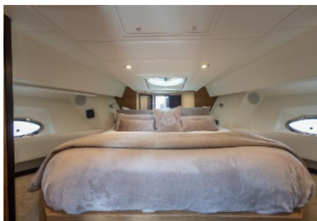
Astondoa 43 GLX For Sale