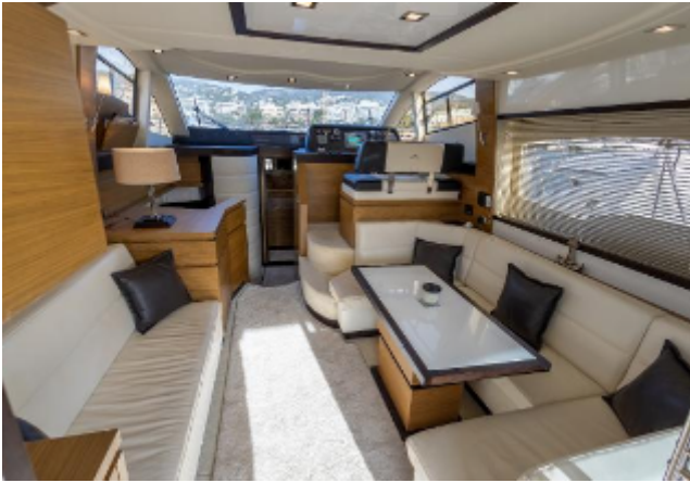
Astondoa 43 GLX For Sale