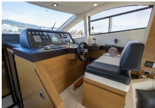
Astondoa 43 GLX For Sale