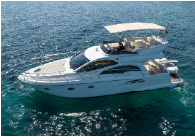
Astondoa 43 GLX For Sale