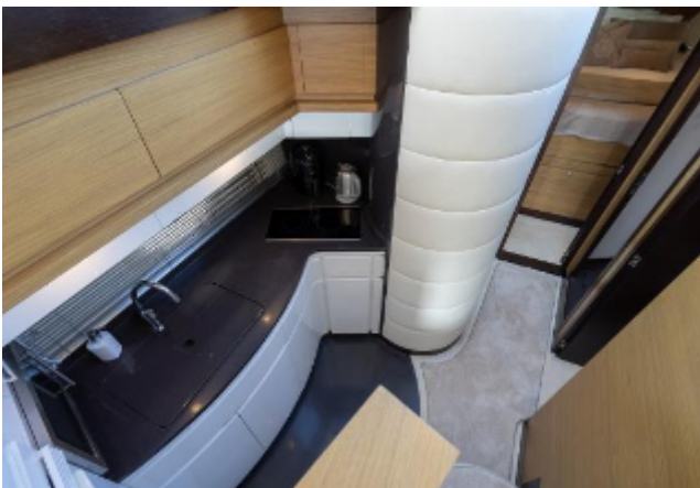
Astondoa 43 GLX For Sale