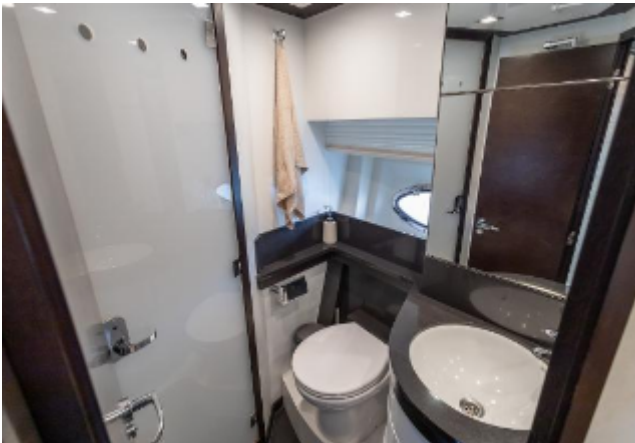
Astondoa 43 GLX For Sale