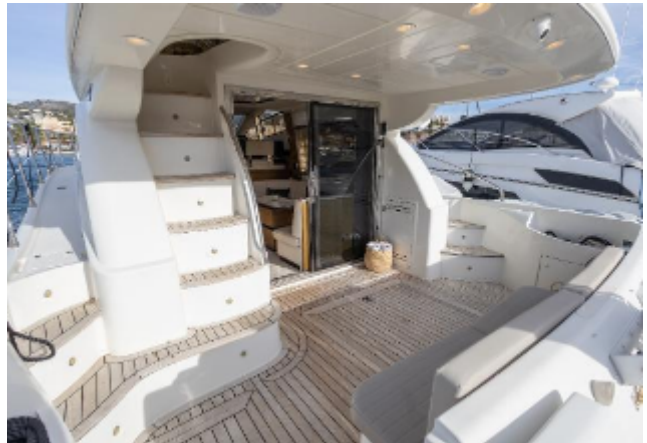
Astondoa 43 GLX For Sale