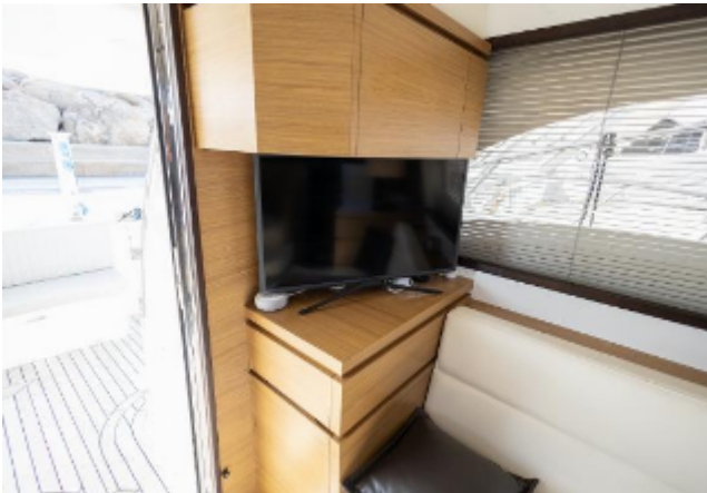
Astondoa 43 GLX For Sale