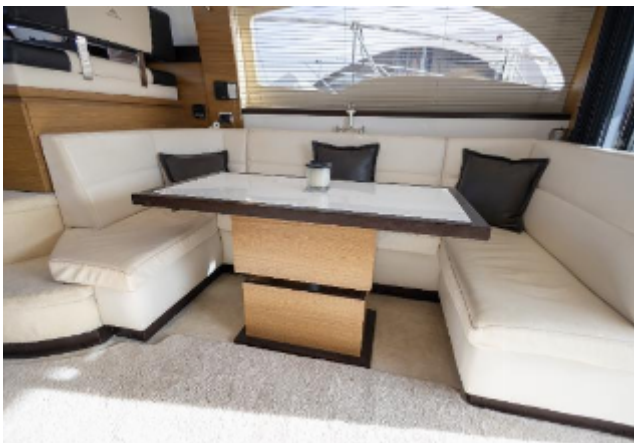
Astondoa 43 GLX For Sale