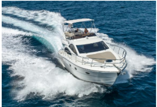
Astondoa 43 GLX For Sale