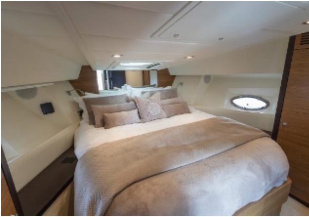
Astondoa 43 GLX For Sale