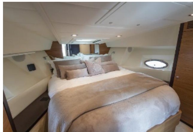
Astondoa 43 GLX For Sale