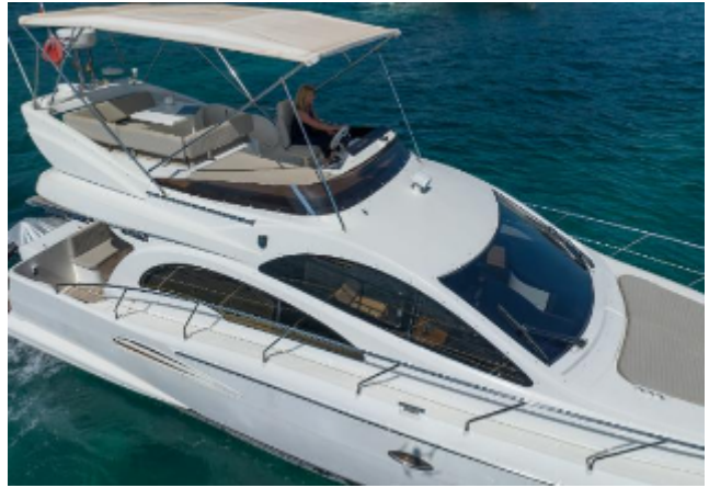
Astondoa 43 GLX For Sale