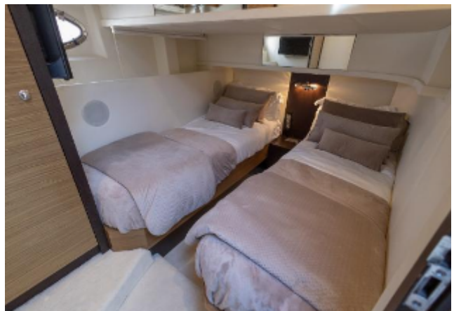
Astondoa 43 GLX For Sale