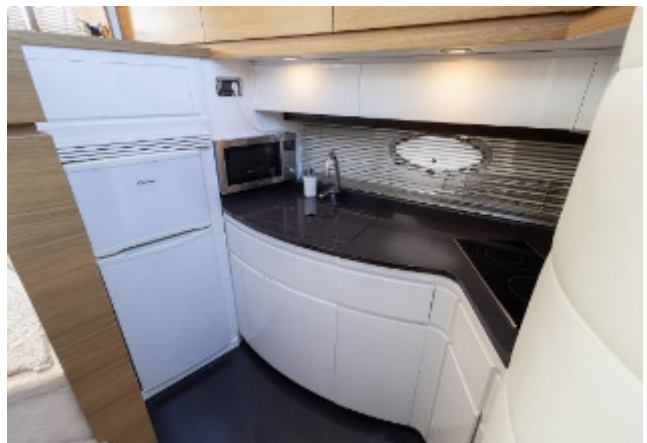
Astondoa 43 GLX For Sale