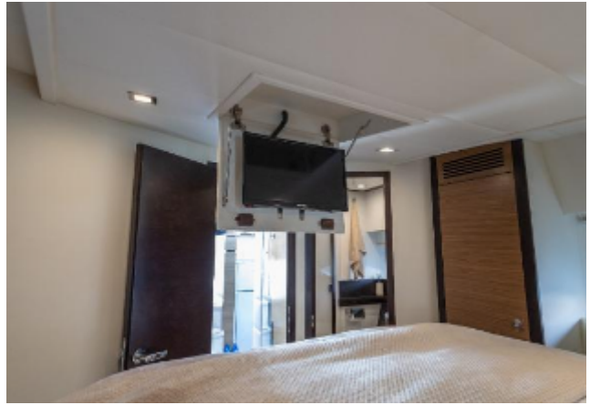
Astondoa 43 GLX For Sale