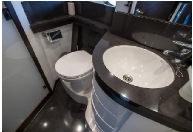
Astondoa 43 GLX For Sale