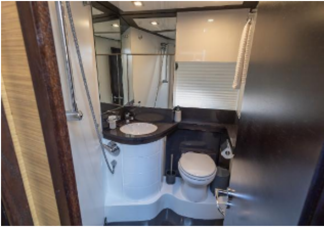
Astondoa 43 GLX For Sale