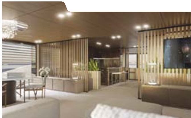
CATAMARANS • WIDERCAT92

Their design goes one step further, with spacious interiors that are finished to an exquisite luxury standard, with sociable living areas, dinettes, jacuzzis, wet bars and more. The yachts of tomorrow are already here.