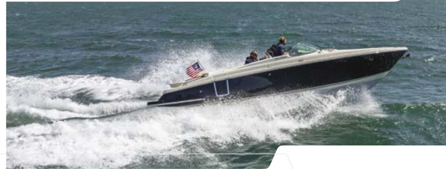
LAUNCH 28 GT

An ideal mid-size day boat for your family, she combines timeless Chris-Craft style with options on metallic paints and cross-stitched upholstery, enabling you to reflect your own personality and tastes. Providing generous seating for ten people, she incorporates comfortable cushioned benches and a relaxing rear-facing chaise lounge. Plus, the design features multiple cup holders and clever storage spots, housing fenders, a bathing ladder and an under-seat cooler.