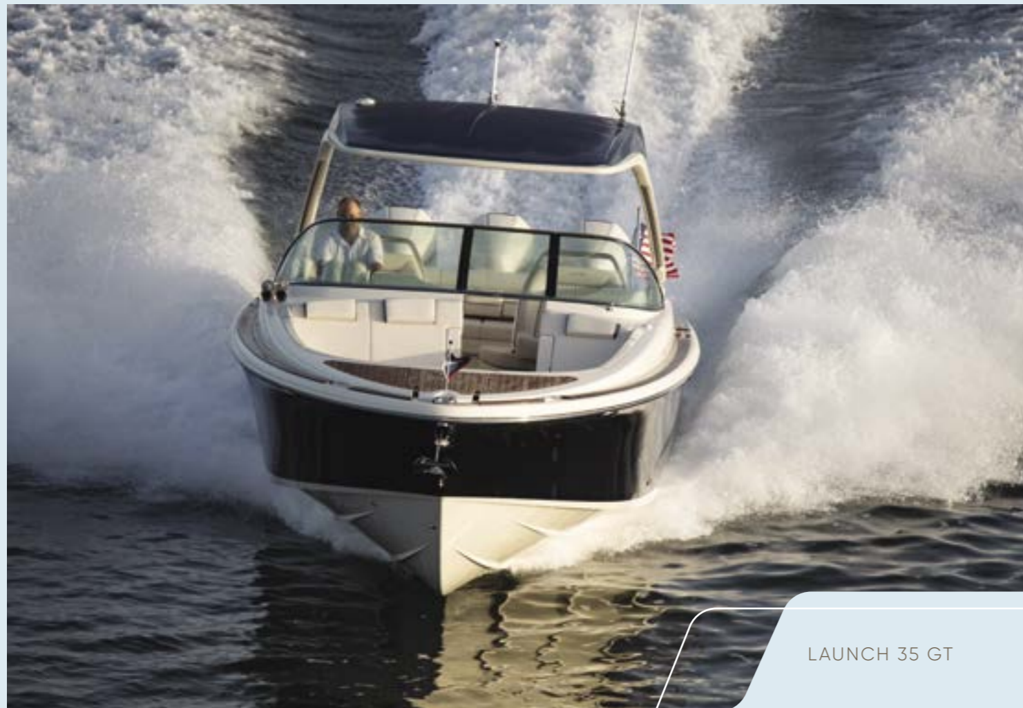
LAUNCH 35 GT

Thanks to a unique distribution agreement, Chris-Craft UK & Balearics operates under the Argo Yachting umbrella, bringing the timeless beauty and exhilarating experience of these crafted boats to Europe's most exciting yachting destinations.