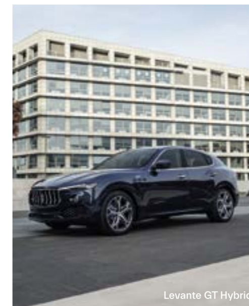
Levante GT Hybrid