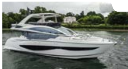
PEARL 62 // 2020 // £1,795,000 UK TAX PAID SWANWICK, UK // AY2145