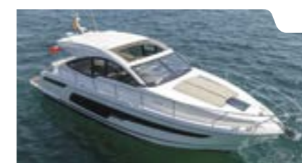
FAIRLINE TARGA 48 OPEN // 2019 // £749,000 TAX PAID MALLORCA, SPAIN // AD0821