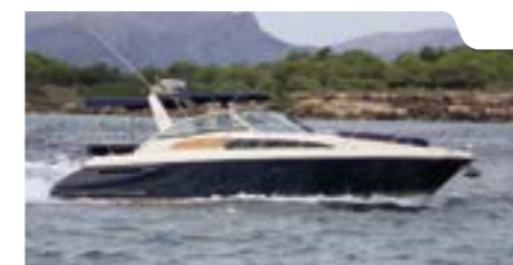
CHRIS-CRAFT ROAMER 36 // 2004 // €137,500 EU TAX PAID MALLORCA, SPAIN // AY2040