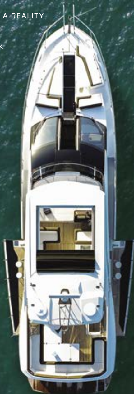
IMAGE: GALEON 640 FLY

CHRIS-CRAFT, SAXDOR AND PARDO YACHTS NOW IN STOCK