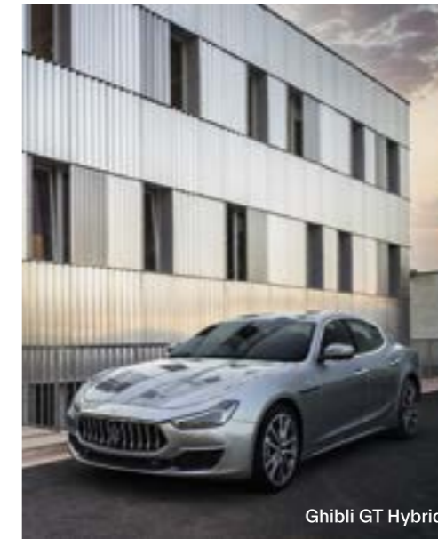
Ghibli GT Hybrid

A bold move that will stake Maserati's claim as the first Italian luxury car brand to produce full-electric models. The new GranTurismo, which debuts next year, will be the first car in Maserati's history to adopt 100% electric solutions. This year also sees the launch of the Grecale, an exciting new SUV that is designed to be the perfect, bold synthesis of avant-garde and passion, innovation and timeless design. It is available in three versions and next year the range will be bolstered by a fourth full-electric version. The existing Ghibli, Levante and Quattroporte lineup has also been significantly enhanced with the introduction of new editions, including the MY22 range with its GT, Modena and Trofeo trims.