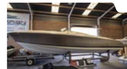
CHRIS-CRAFT LAUNCH 32 // 2014 // €230,000 EU TAX PAID MALLORCA, SPAIN // AY2123