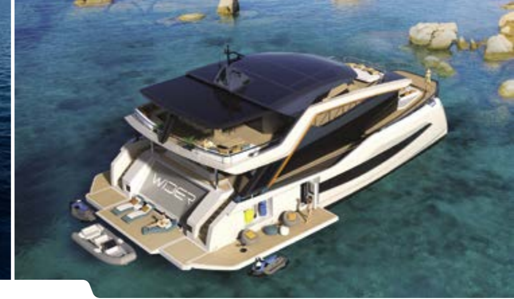
SUPERYACHTS • WIDER 150

Utilising Wider's renowned hybrid technology, this is luxury yachting that keeps the environment in mind with an ecological speed of 10 knots whilst also reaching up to 14 knots.