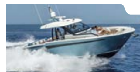
OCEAN ALEXANDER 45 DIVERGENCE // 2020 // €890,000 EX TAX MALLORCA, SPAIN // AY2143