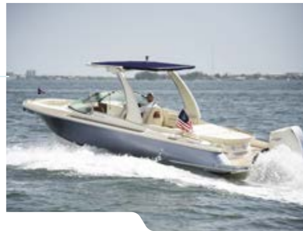
LAUNCH 25 GT

Designed as a sporty and luxurious bow rider, the Launch 25 GT is watersports friendly, quick, responsive and stunningly beautiful. Customization is endless, starting with your choice of sterndrive or outboard propulsion, as well as either a bimini, power folding, or hard top.