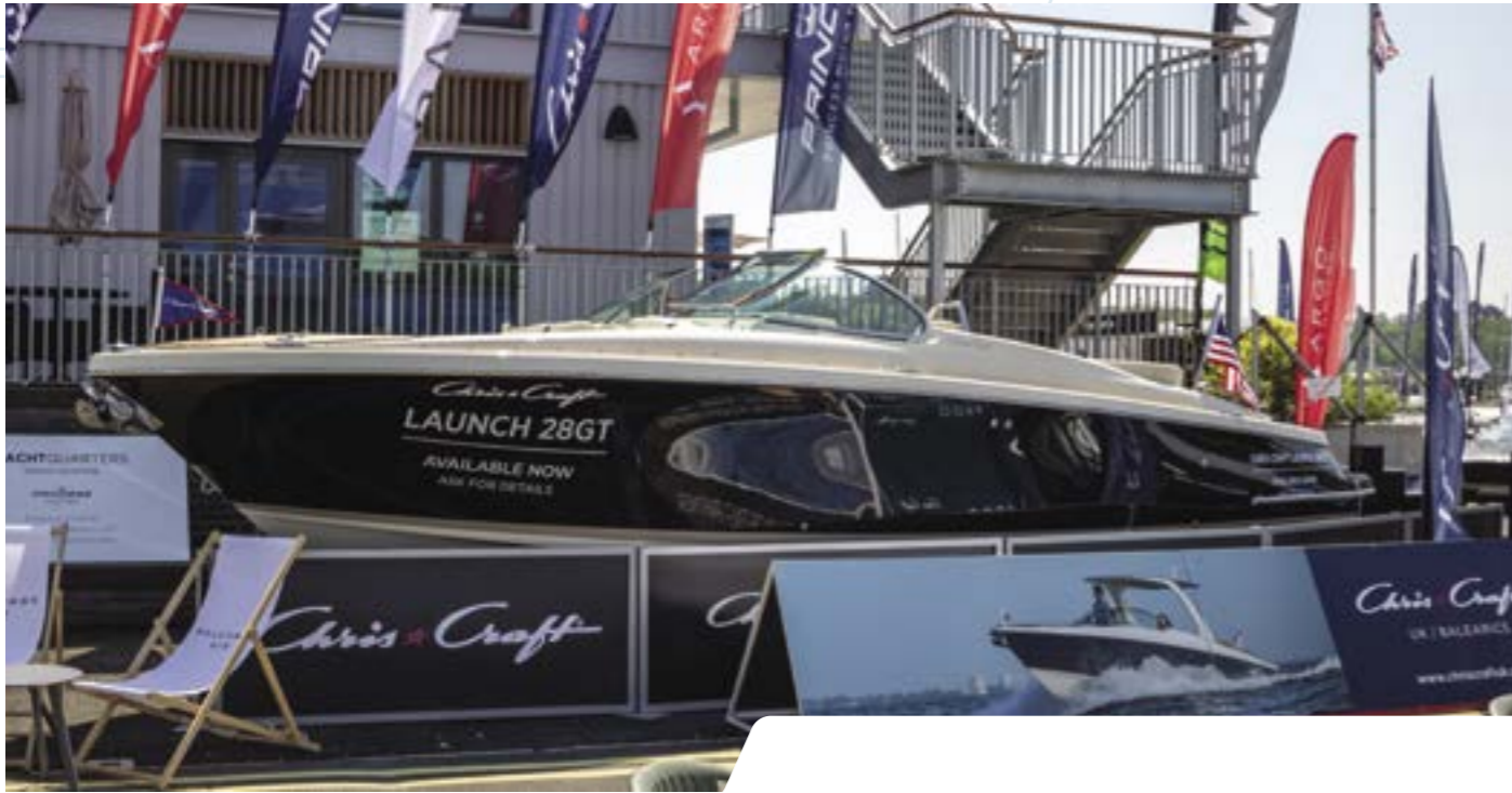
British Motor Yacht Show 11 - 14 May 2023

Join the Argo team and explore sensational yachts at the following boat shows across Europe. Dedicated teams from Argo Yachting will be delighted to welcome visitors on board a selection of boats from Chris-Craft, Saxdor, Pardo, Galeon, Greenline and Wider Yachts.