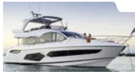
SUNSEEKER MANHATTAN 68 // 2021 // €2,900,000 EU TAX PAID LIGURIA, ITALY // AYS2058