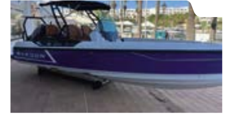
SAXDOR 200 SPORT // 2022 // €34,500 EU TAX PAID MALLORCA, SPAIN // AY2148

To make an appointment call us on +44 (0)1489 885656 or email info@argoyachting.com