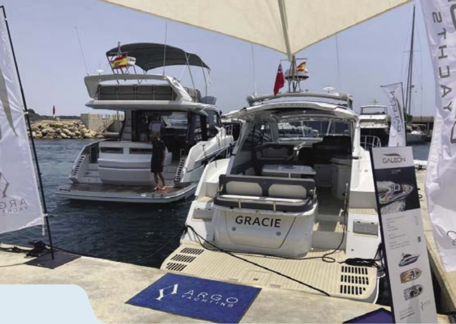
Galeon Launch Event, Port Calanova, Mallorca 28 - 30 June

To mark the launch of this fantastic new distribution agreement with Galeon Yachts, Argo invited guests to take a look and sea trial the Galeon 405 HTS and 460 FLY.