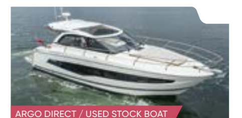
JEANNEAU LEADER 40 // 2020 // £399,000 UK TAX PAID SWANWICK, UK // AD0825