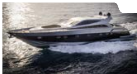
ALFAMARINE 78 // 2007 // €749,000 EU TAX PAID PORT DE LA RAGUE, FRANCE // AY1981