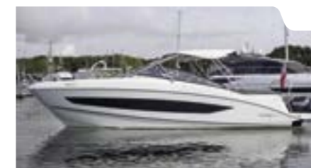
BENETEAU FLYER 10 // 2021 // £199,950 UK TAX PAID SWANWICK, UK // AY2135