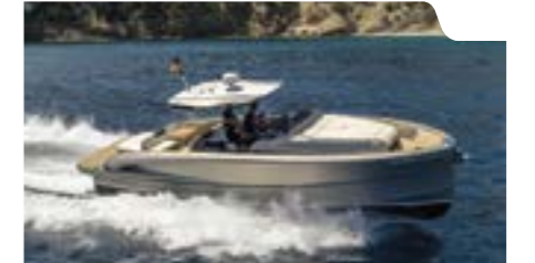
SOLARIS OPEN 40 // 2022 // €659,000 EX TAX IBIZA, SPAIN // AY2115