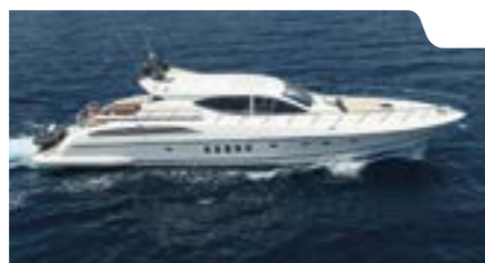
ARNO LEOPARD 24 // 2003 // €485,000 EU TAX PAID MALLORCA, SPAIN // AY2117