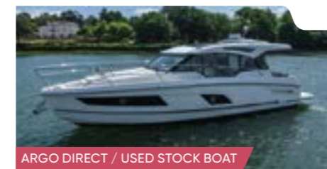
GRANDEZZA 37 // 2020/21 // £399,000 UK TAX PAID SWANWICK, UK // AD0826