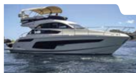
FAIRLINE SQUADRON 48 // 2018 // €899,000 EU TAX PAID IBIZA, SPAIN // AY2067