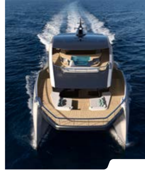
SUPERYACHTS • WIDER 165

The future-proof, 28-metre Catamaran powered by the Sun. The WiderCat92 makes use of its generous proportions, with four double guest cabins, saloon, beach club and sky lounge, all finished to the highest standard. Natural light pours through large windows throughout the vessel, with light teak accents offering calm surroundings that reflect the ecological philosophy that Wider pride themselves on. Premium finishes and features throughout have been implemented for every guest and owner to enjoy a truly magical experience. She has 170m 2 of solar panels making this luxury catamaran self-sufficient when anchored, and she cruises effortlessly at up to 15 knots with hybrid propulsion without leaving a trace on the environment.