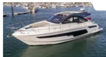
FAIRLINE TARGA 48 OPEN // 2018/20 // £715,000 UK TAX PAID SWANWICK, UK // AY2042