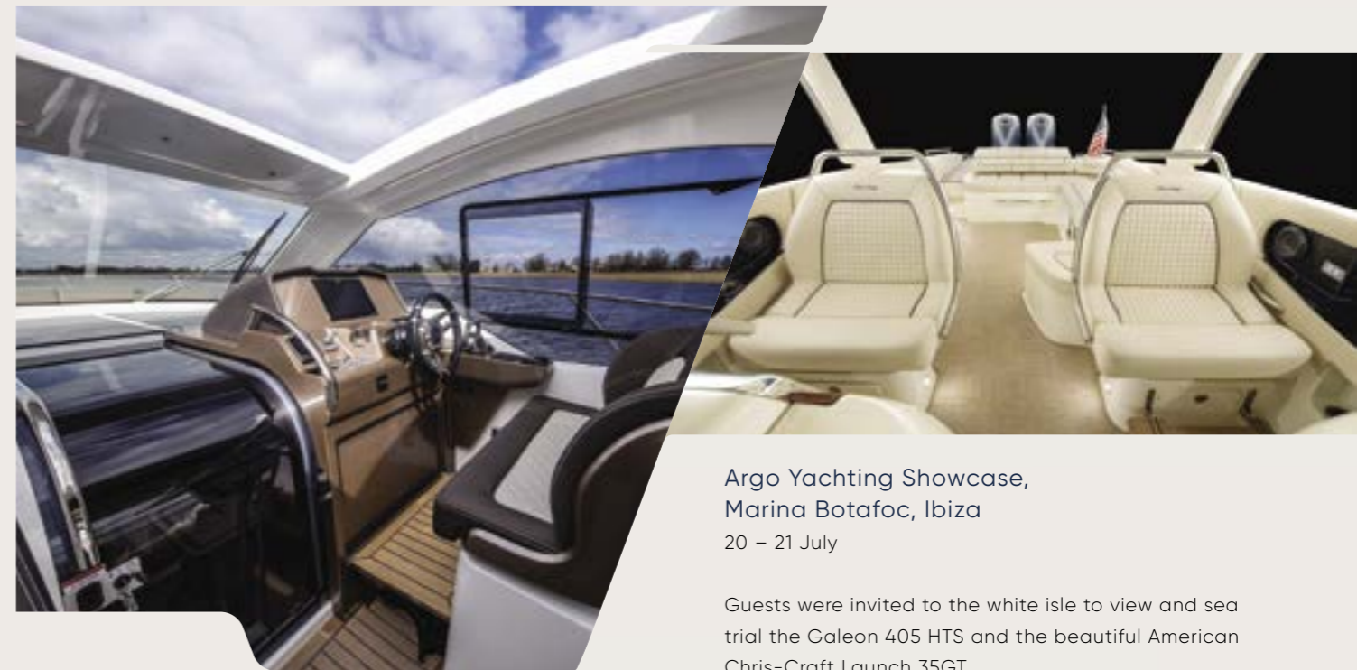
Argo Yachting Showcase, Marina Botafoch, Ibiza 20 - 21 July

To mark the launch of this fantastic new distribution agreement with Galeon Yachts, Argo invited guests to take a look and sea trial the Galeon 405 HTS and 460 FLY.